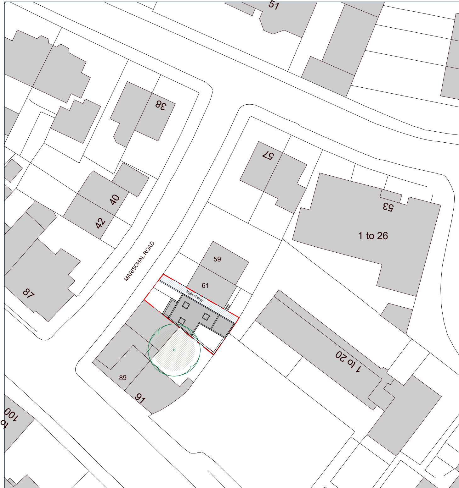
2 Proposed Block Plan 1 : 500