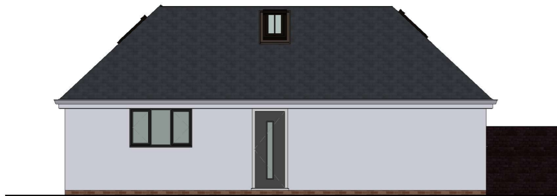
3 South Elevation 1 : 100