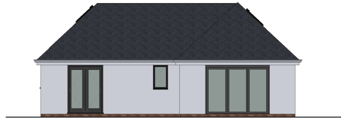
2 North Elevation 1 : 100