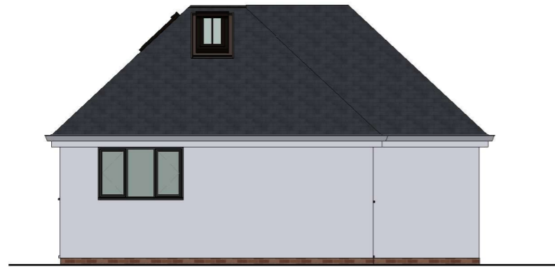
1 East Elevation 1 : 100