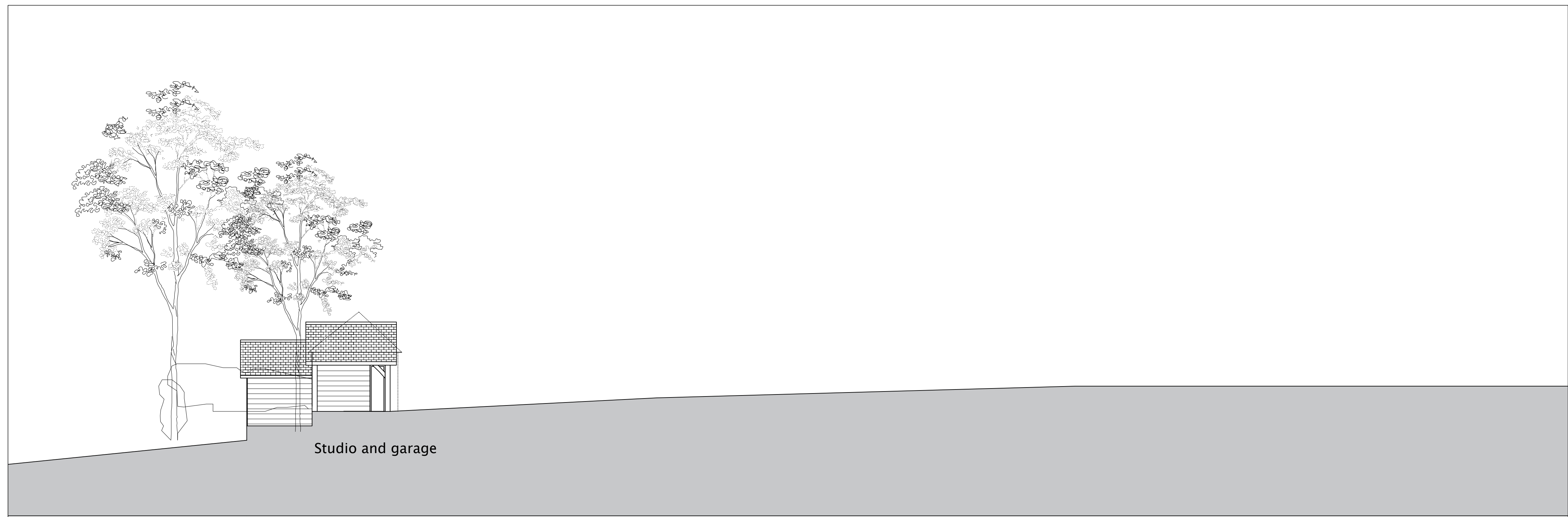
Studio and garage