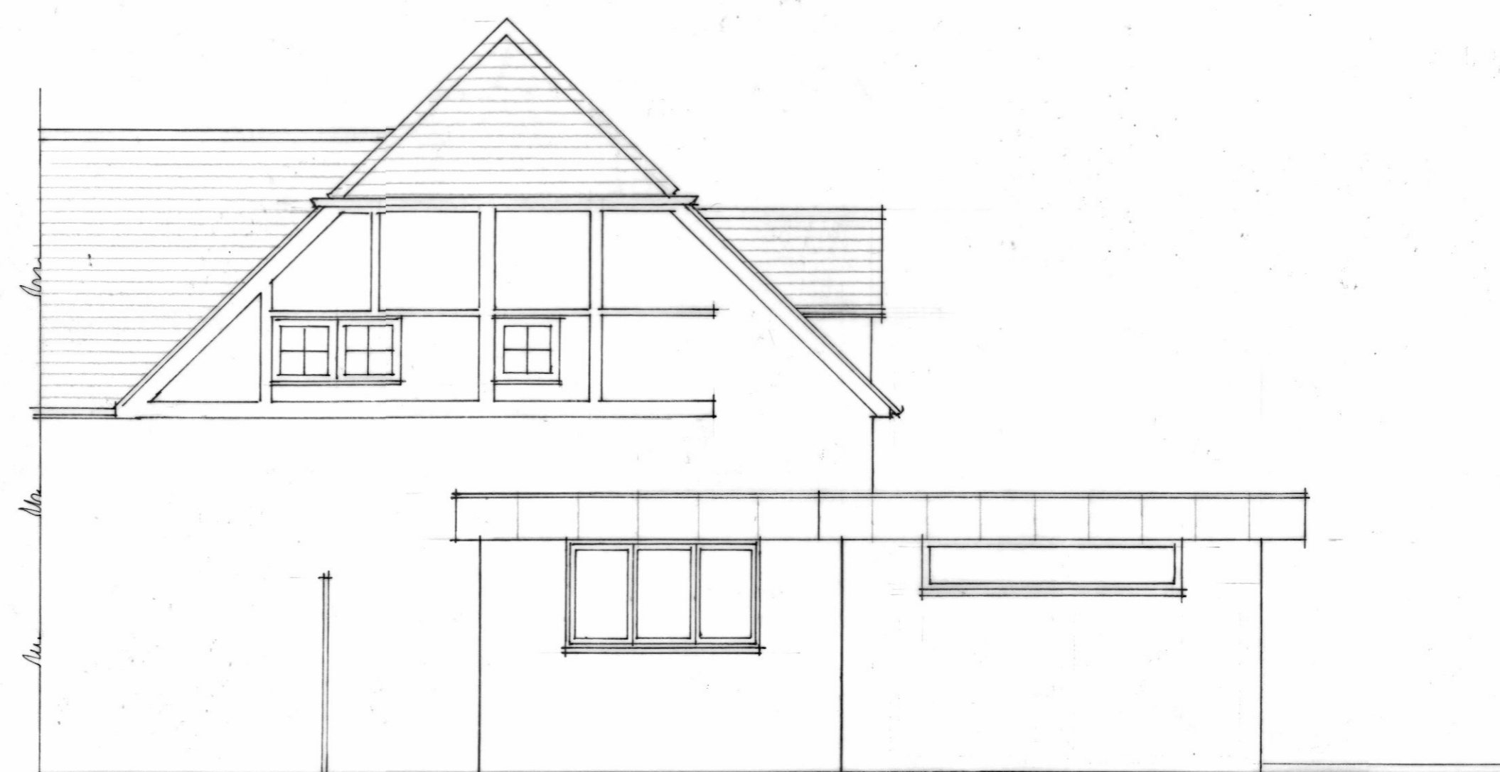
SIDE (NORTH WEST) ELEVATION.