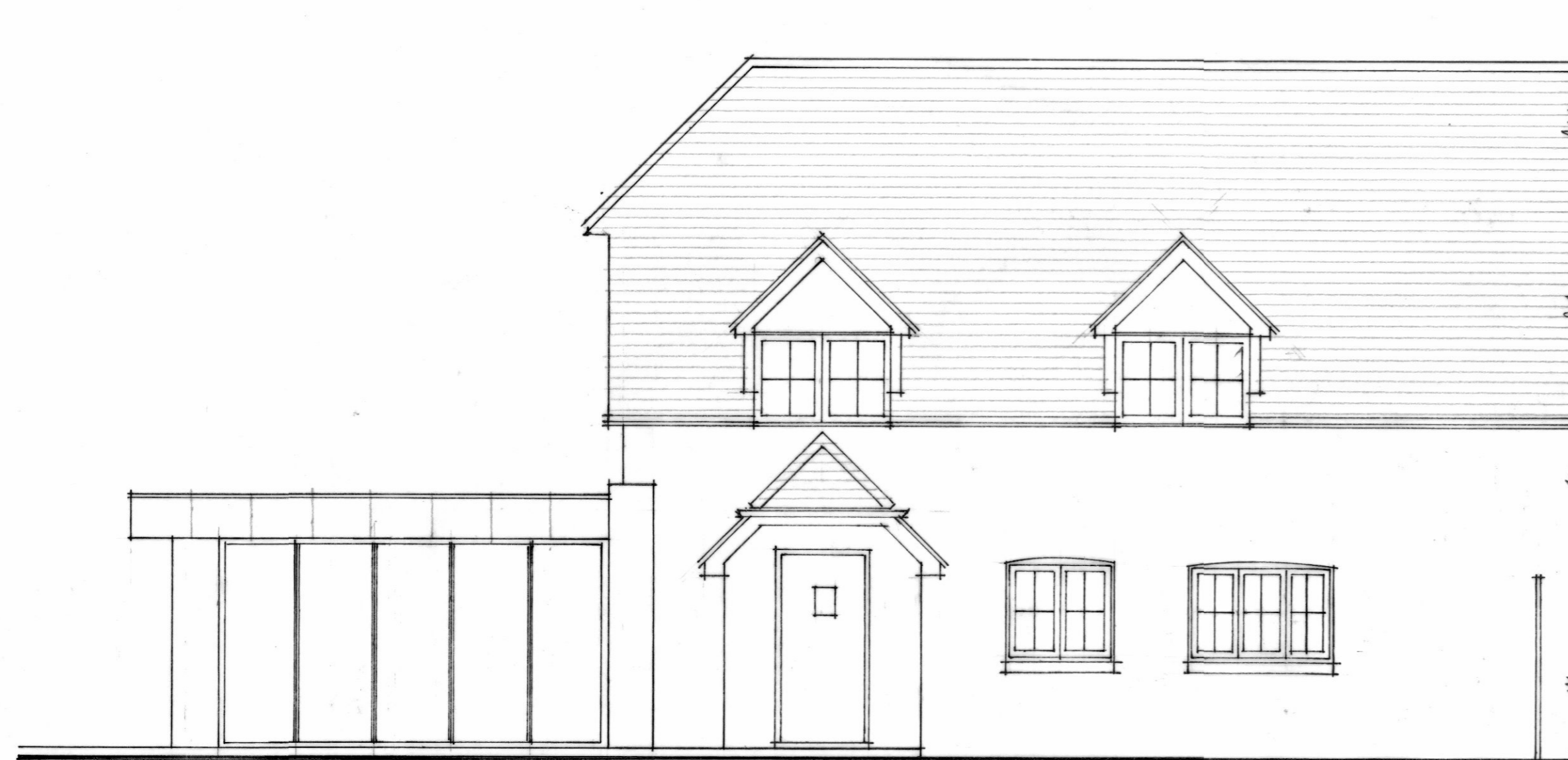
FRONT (SOUTH WEST) ELEVATION.

NOTES: All dimensions must be checked on site and not scaled from this drawing.