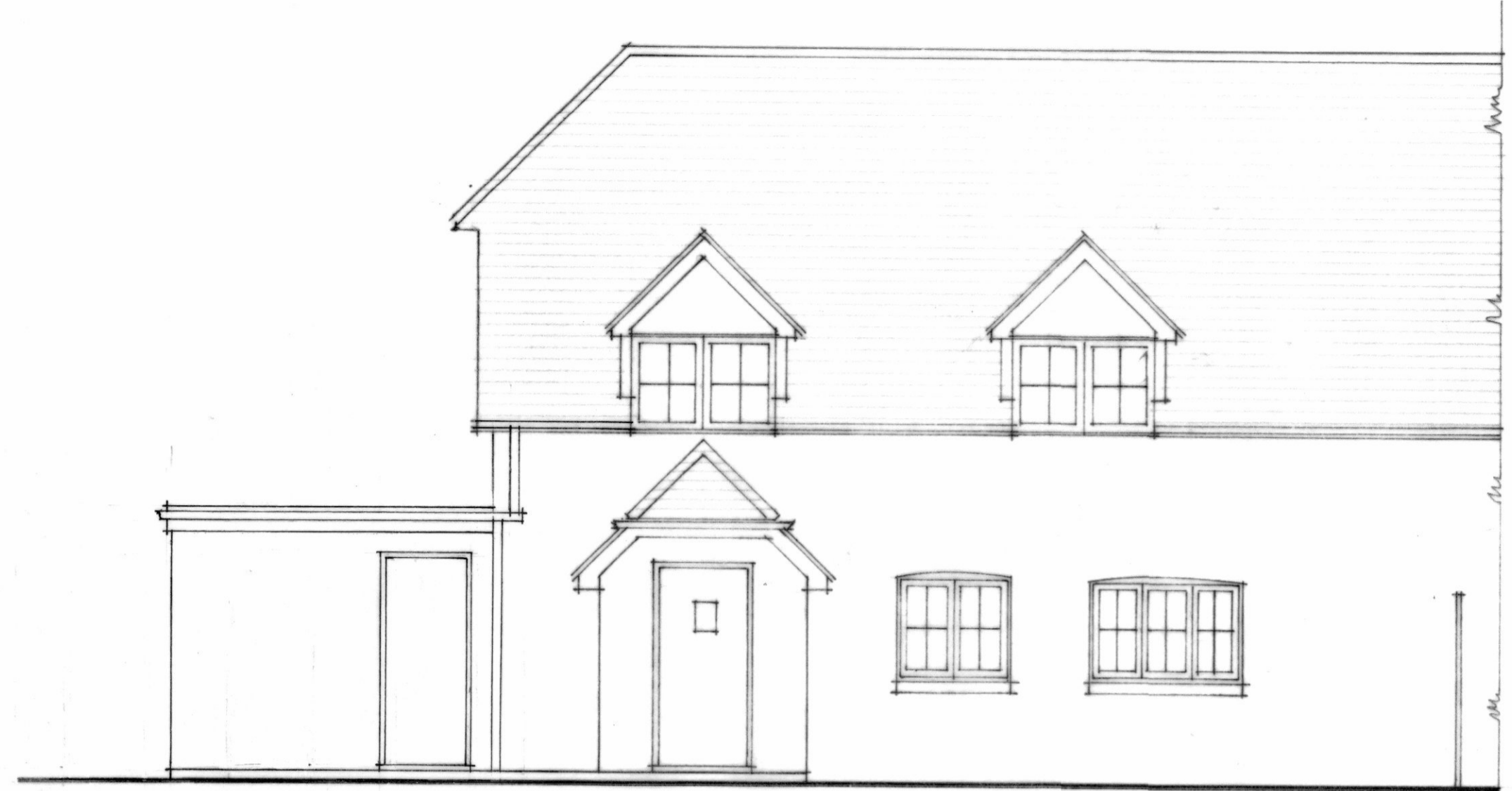
FRONT (SOUTH WEST) ELEVATION.

NOTES: All dimensions must be checked on site and not scaled from this drawing.