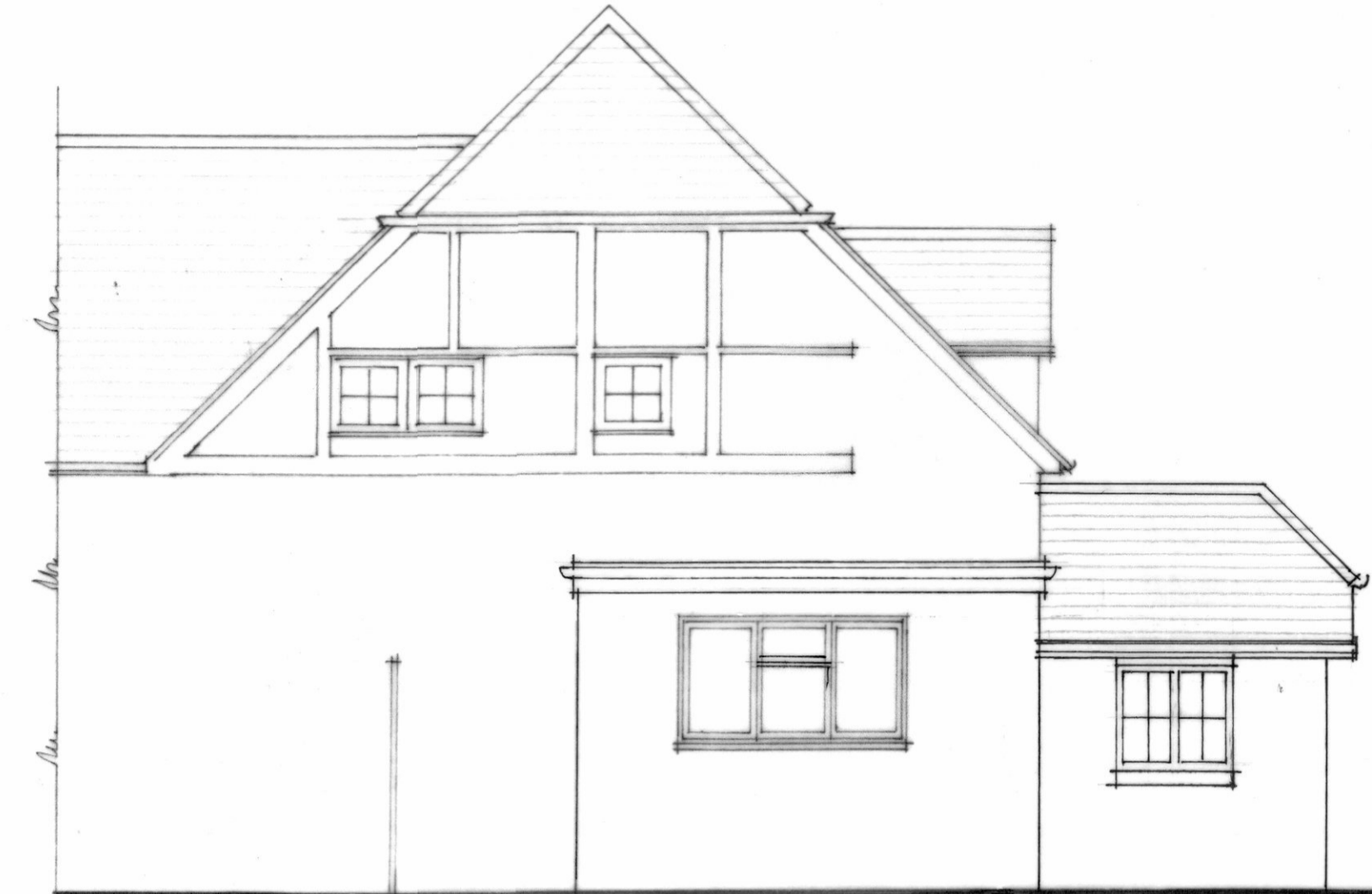
SIDE (NORTH WEST) ELEVATION.