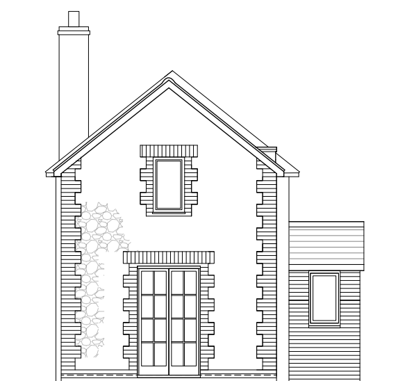
Proposed South East Elevation 1:100

Notes: Do not scale unless for planning purposes Use only figured dimensions for construction All dimensions to be checked and verified on site by the contractor; the architect should be notified immediately of any significant discrepancies All dimensions in mm (millimeters) unless otherwise states Ordnance Survey paper map copying license is 100045241 SCALE IS CORRECT WHEN PRINTED ON ISO A3