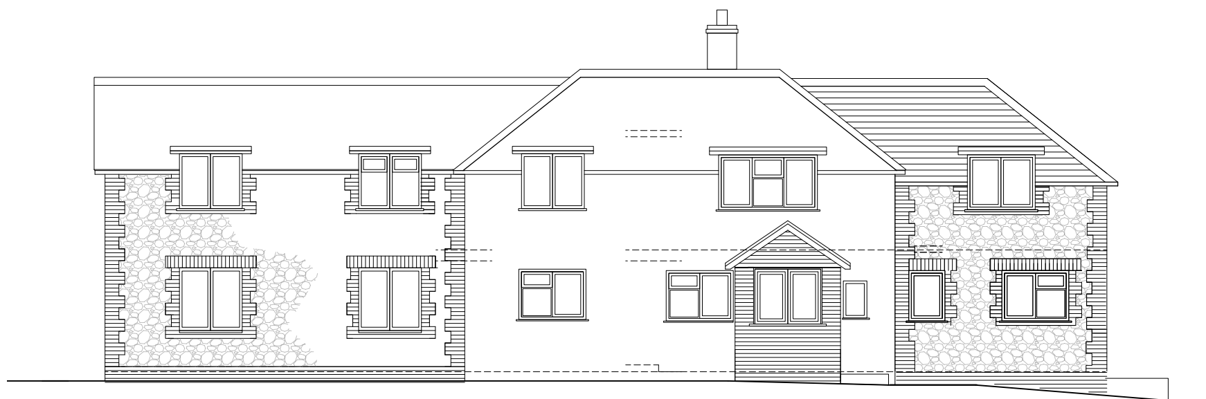
Proposed North East Elevation 1:100