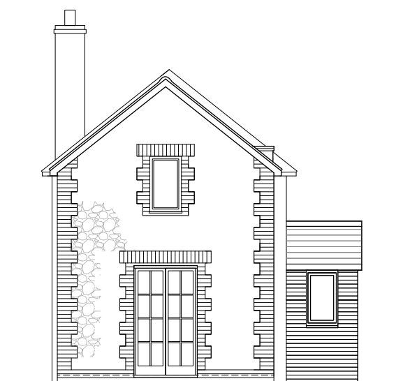
Existing South East Elevation 1:100

Notes: Do not scale unless for planning purposes Use only figured dimensions for construction All dimensions to be checked and verified on site by the contractor; the architect should be notified immediately of any significant discrepancies All dimensions in mm (millimeters) unless otherwise states Ordnance Survey paper map copying license is 100045241 SCALE IS CORRECT WHEN PRINTED ON ISO A3