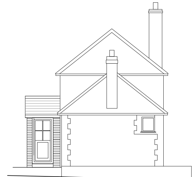
Existing North West Elevation 1:100