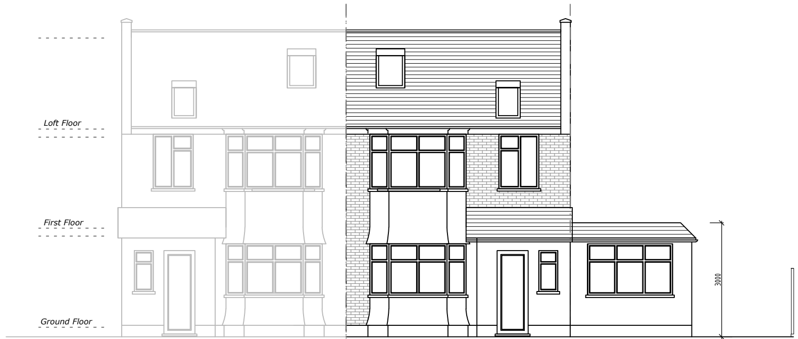
SW Elevation - Facing Deans Way