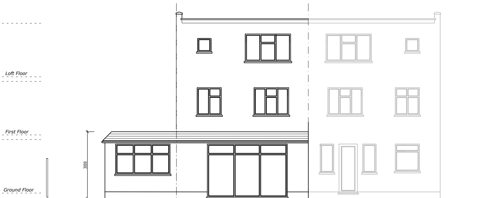
NE Elevation - Rear