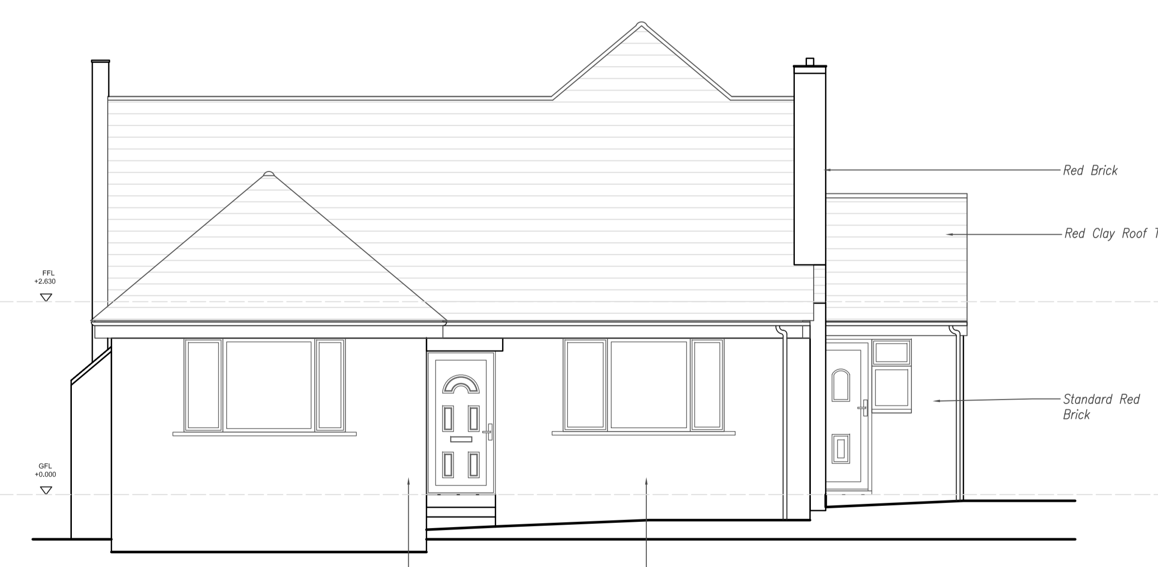
S Front Elevation 1:50

Rev: - Rev Date: 16/11/23 Drawn By: Ayona Rev Details: Initial Issue