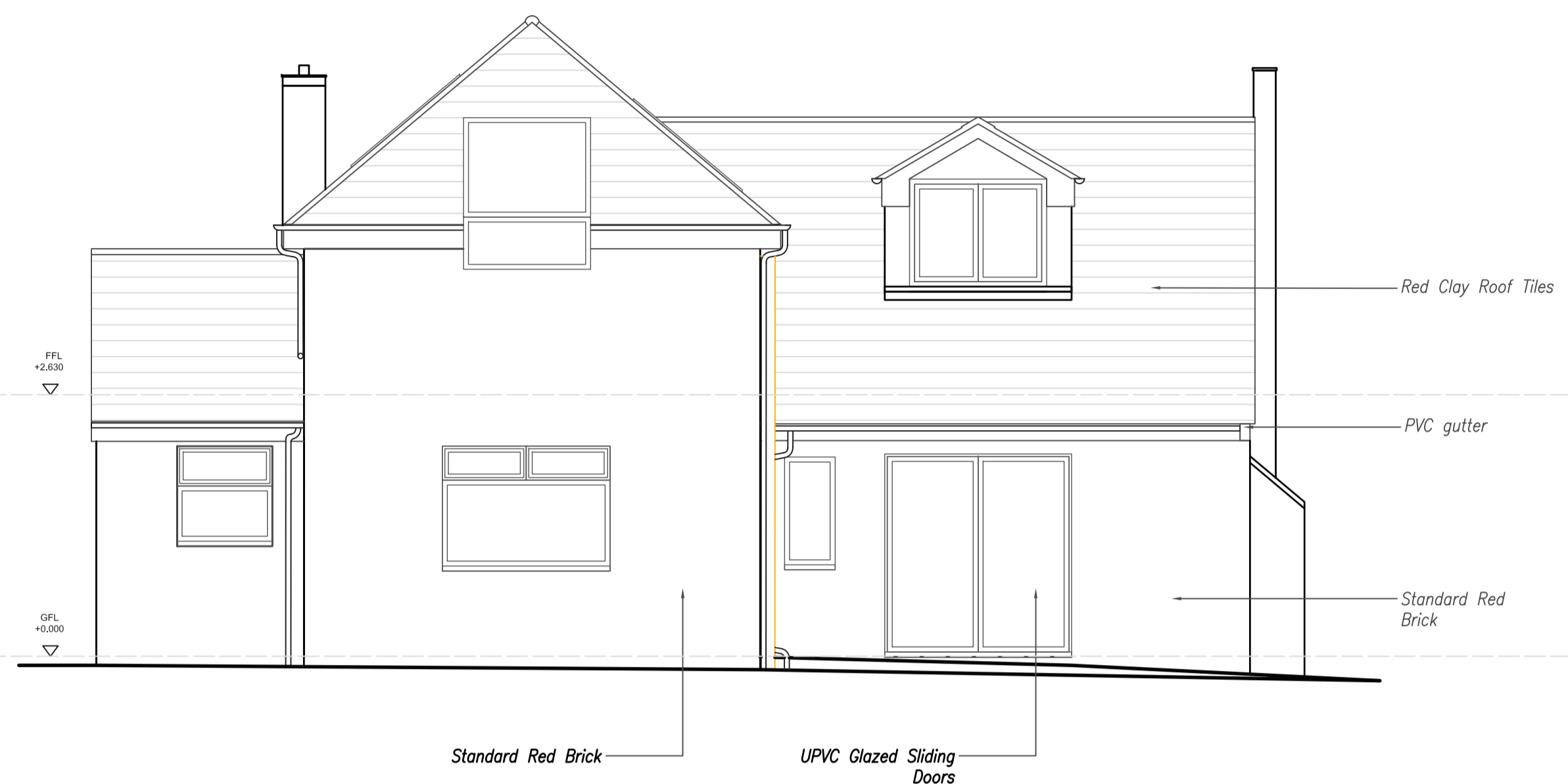
N Rear Elevation 1:50