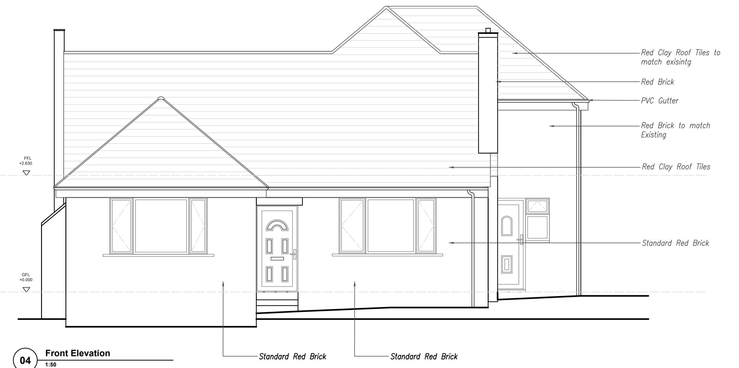
04 Front Elevation 1:50

Rev: A Rev Date: 19/12/23 Drawn By: AJ Rev Details: Planning Issue