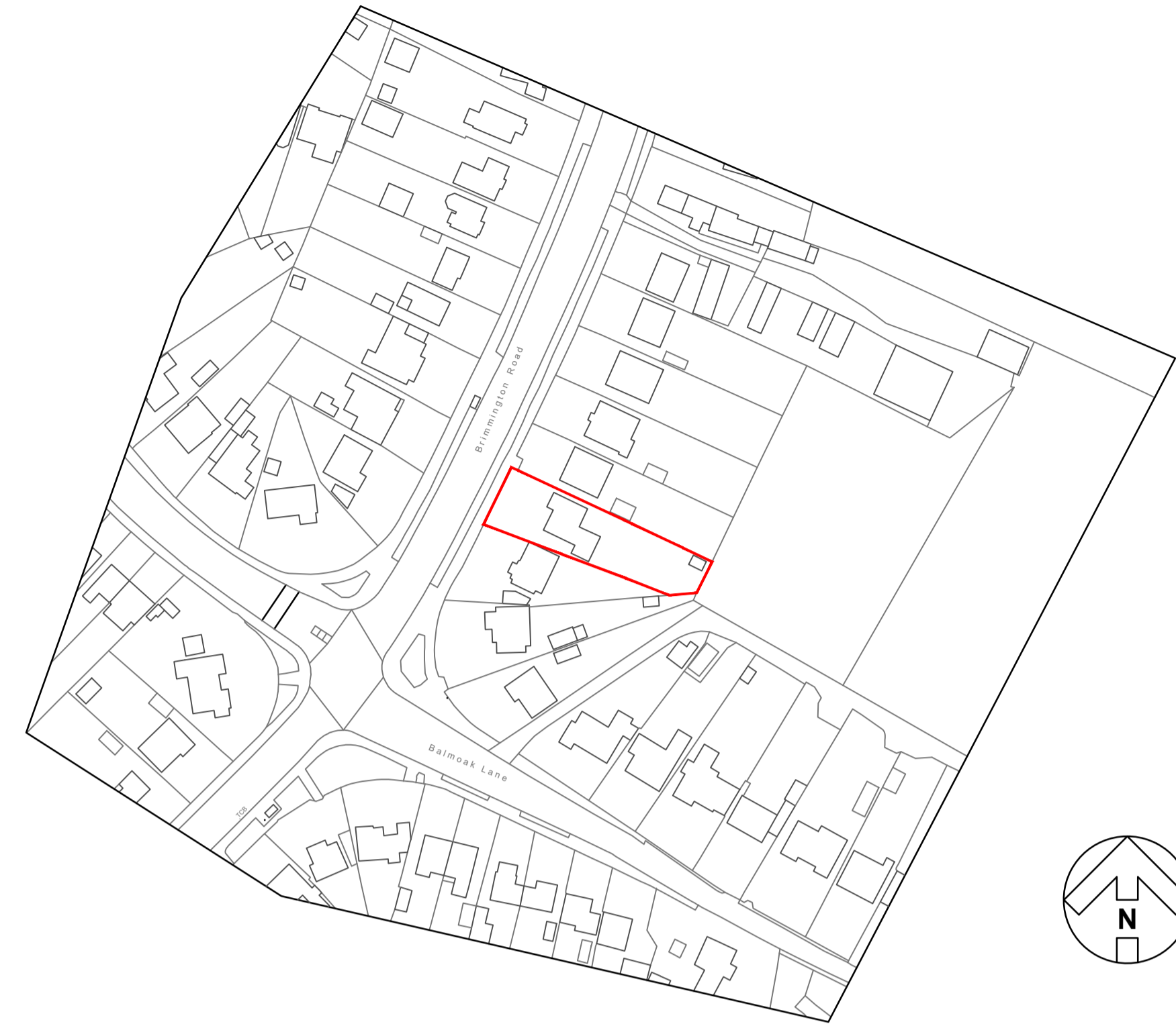
01 Site Location Plan Scale: 1:1250