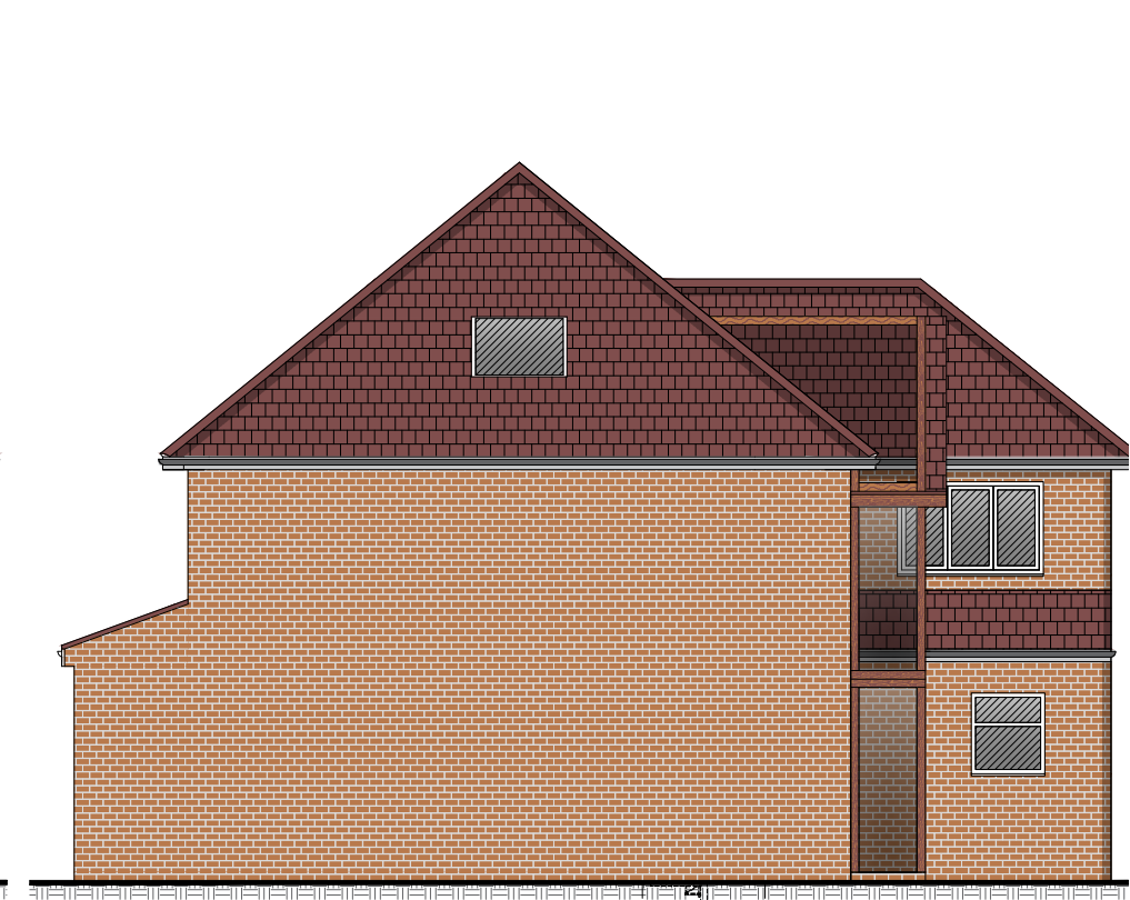
FLANK ELEVATION AS PROPOSED