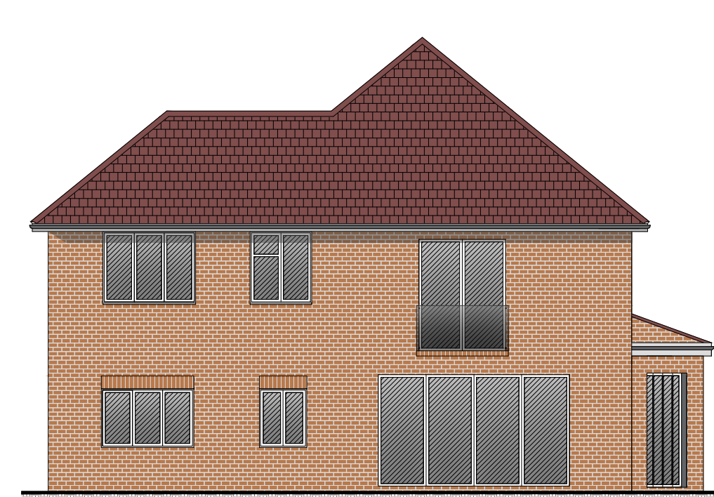
FLANK ELEVATION AS PROPOSED