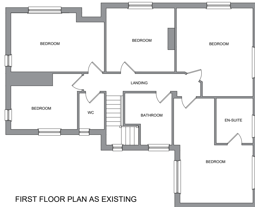
FIRST FLOOR PLAN AS EXISTING