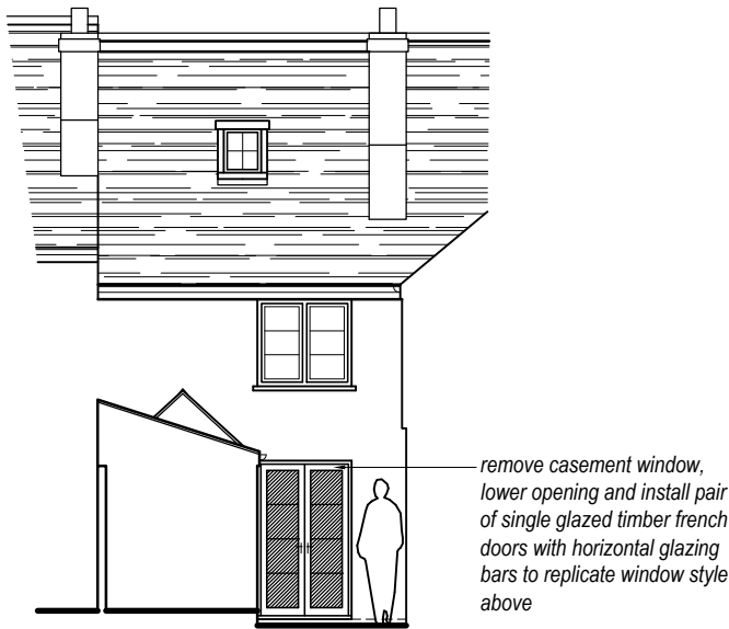
REAR (SE) ELEVATION as Proposed 1:100