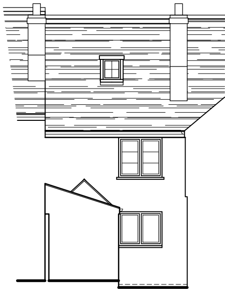
REAR (SE) ELEVATION as Existing 1:100