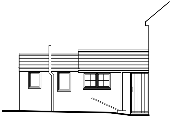
REAR (NE) ELEVATION as Existing 1:100

Existing Materials:- Main 2 storey dwelling:- Roof- plain tile Walls - facing brick - painted white Windows - timber panted white Rear single storey element:- Roof - slate Walls - render panted off white Windows & doors - timber panted white