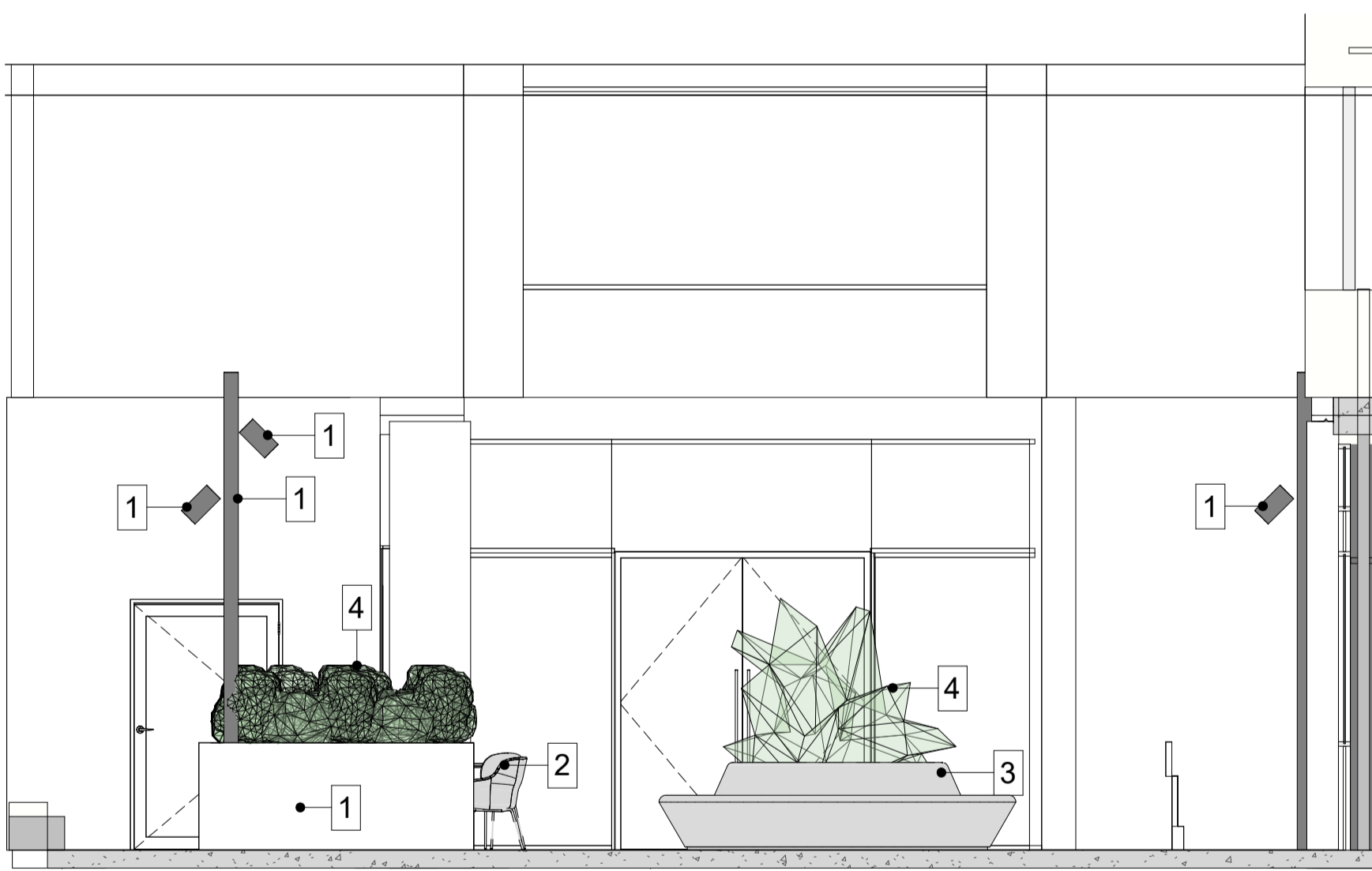
4 Proposed rear entrance elevation Materials 367 1 : 50