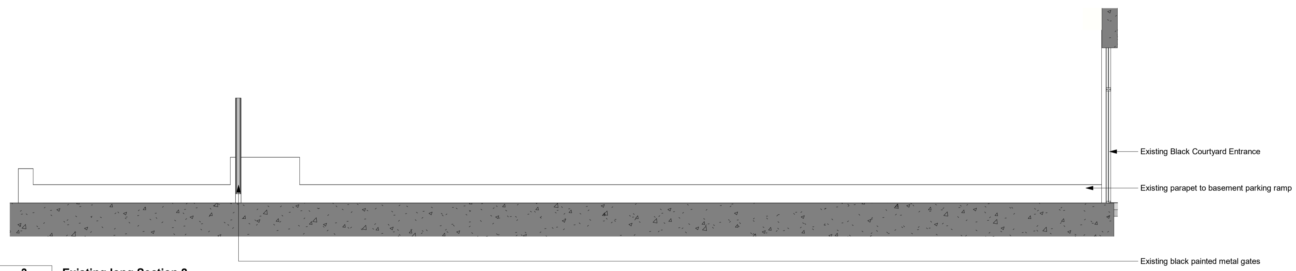
3 Existing long Section 2 359 1 : 50