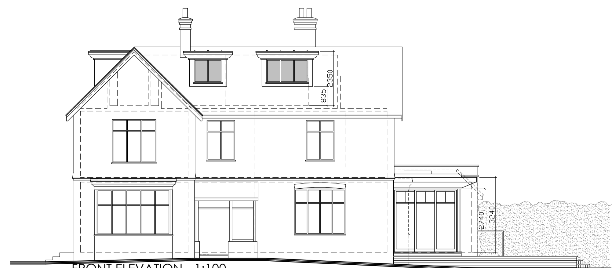
FRONT ELEVATION - 1:100