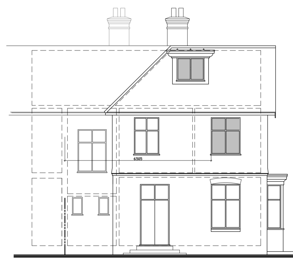
SIDE ELEVATION - 1:100