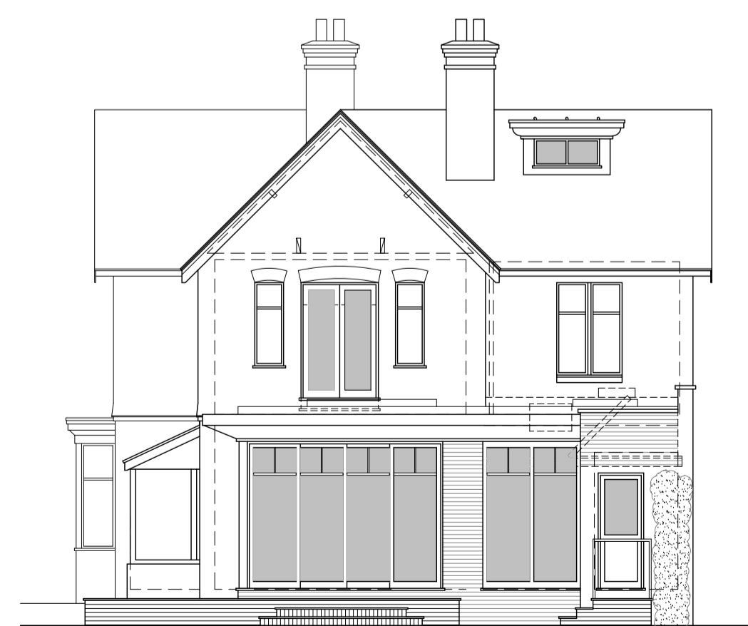
REAR ELEVATION - 1:100