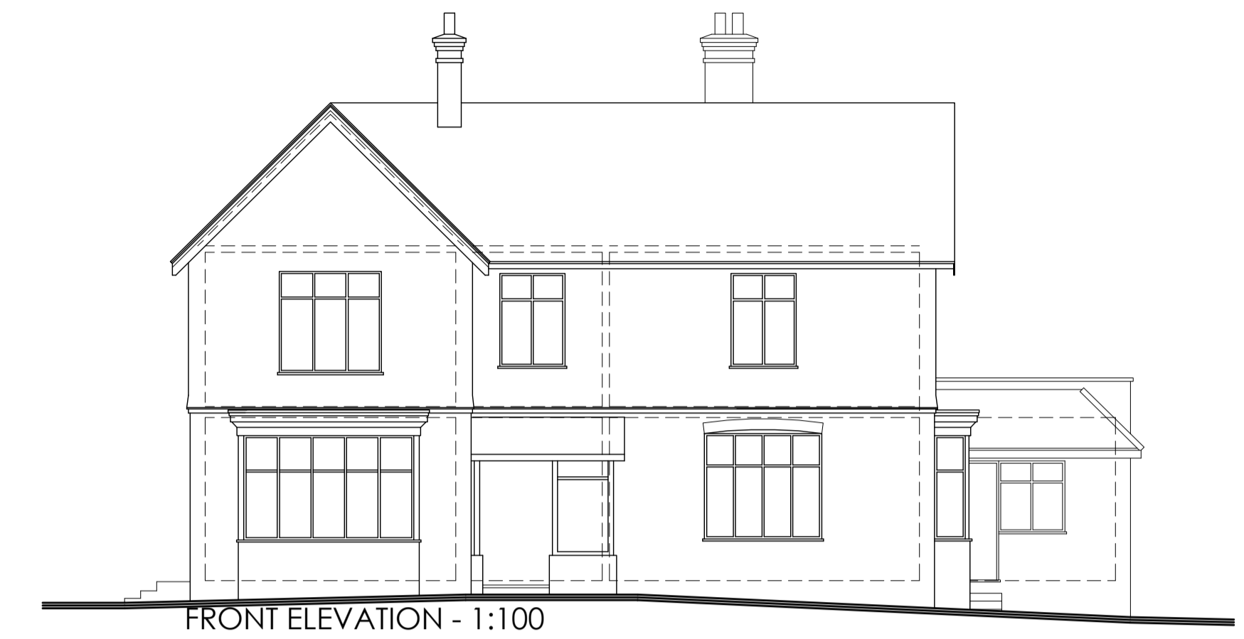
FRONT ELEVATION - 1:100