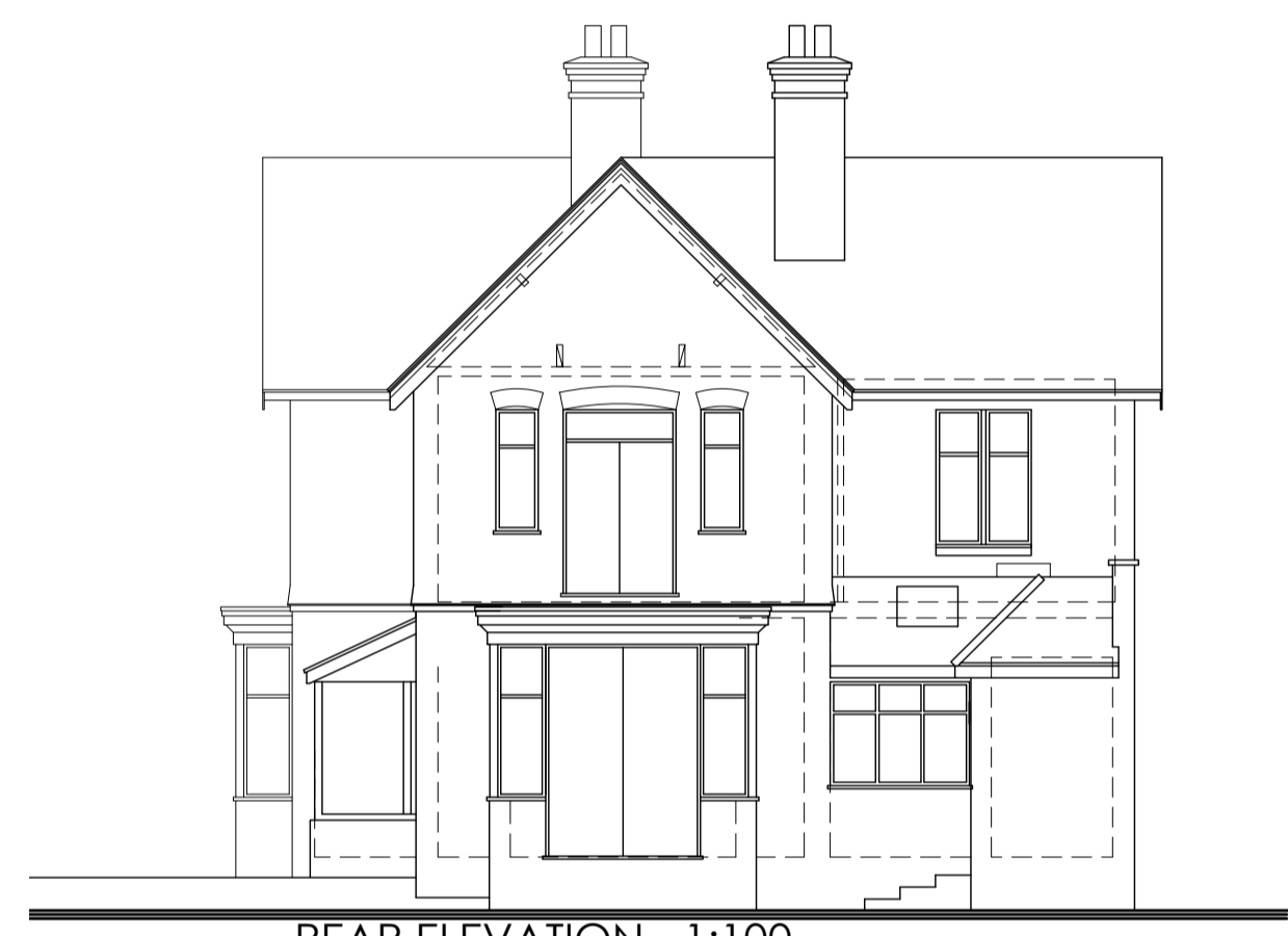
REAR ELEVATION - 1:100