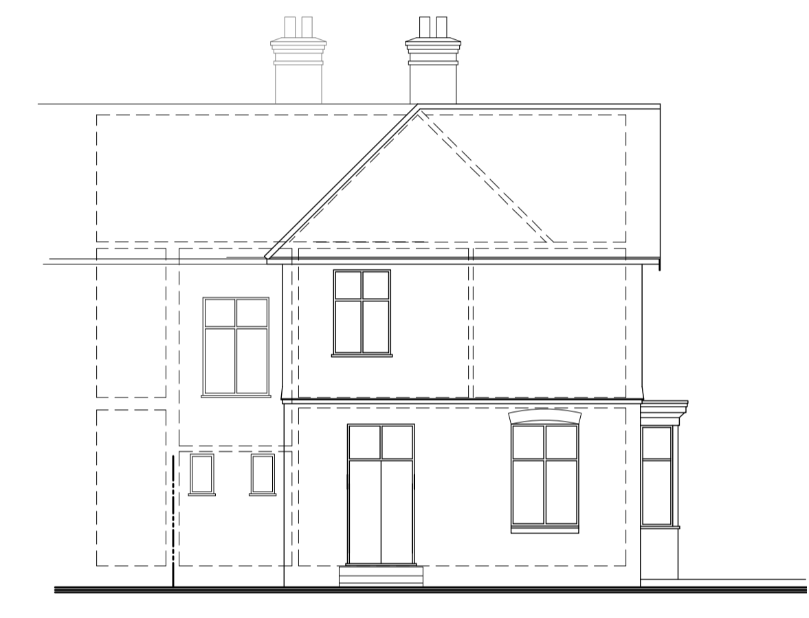
SIDE ELEVATION - 1:100