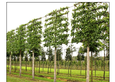
with acoustic fence behind