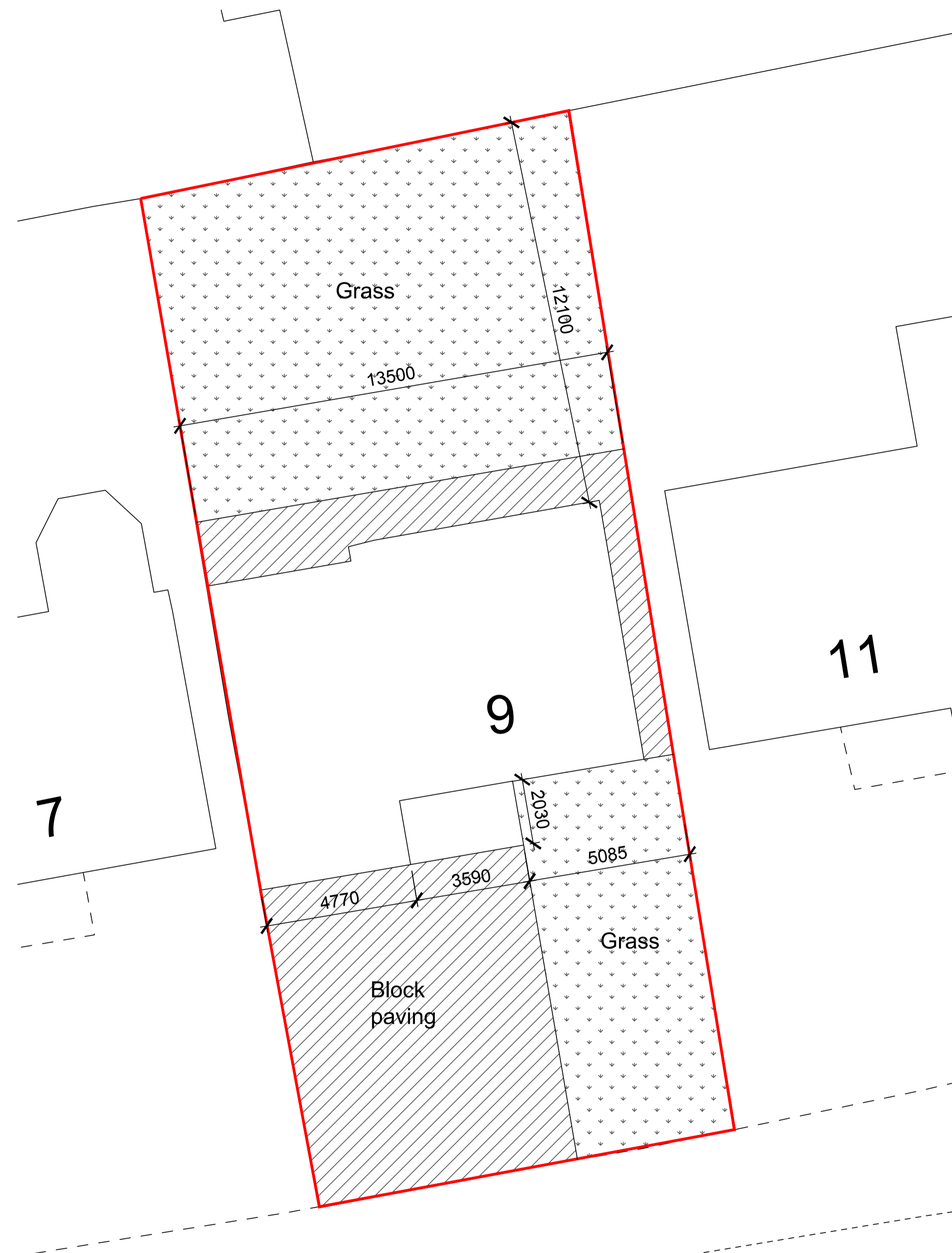
EXISTING SITE BLOCK PLAN Scale 1:100