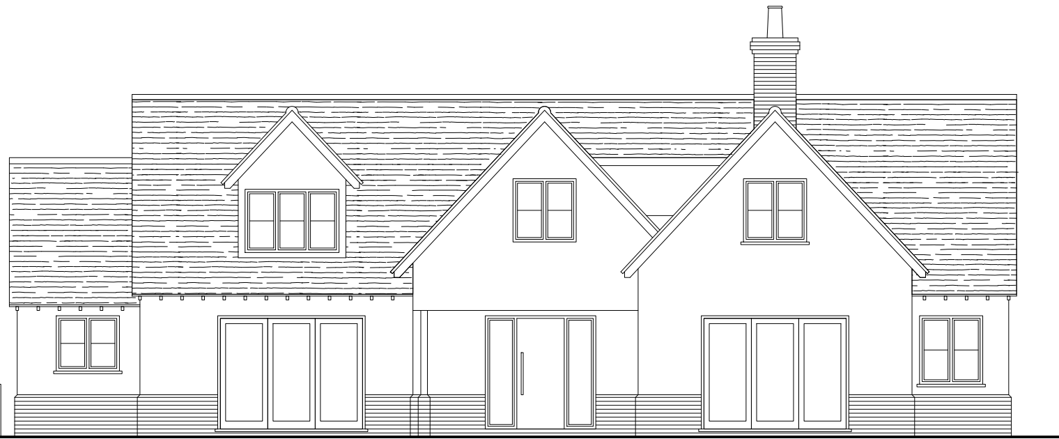
Front elevation (Southeast)