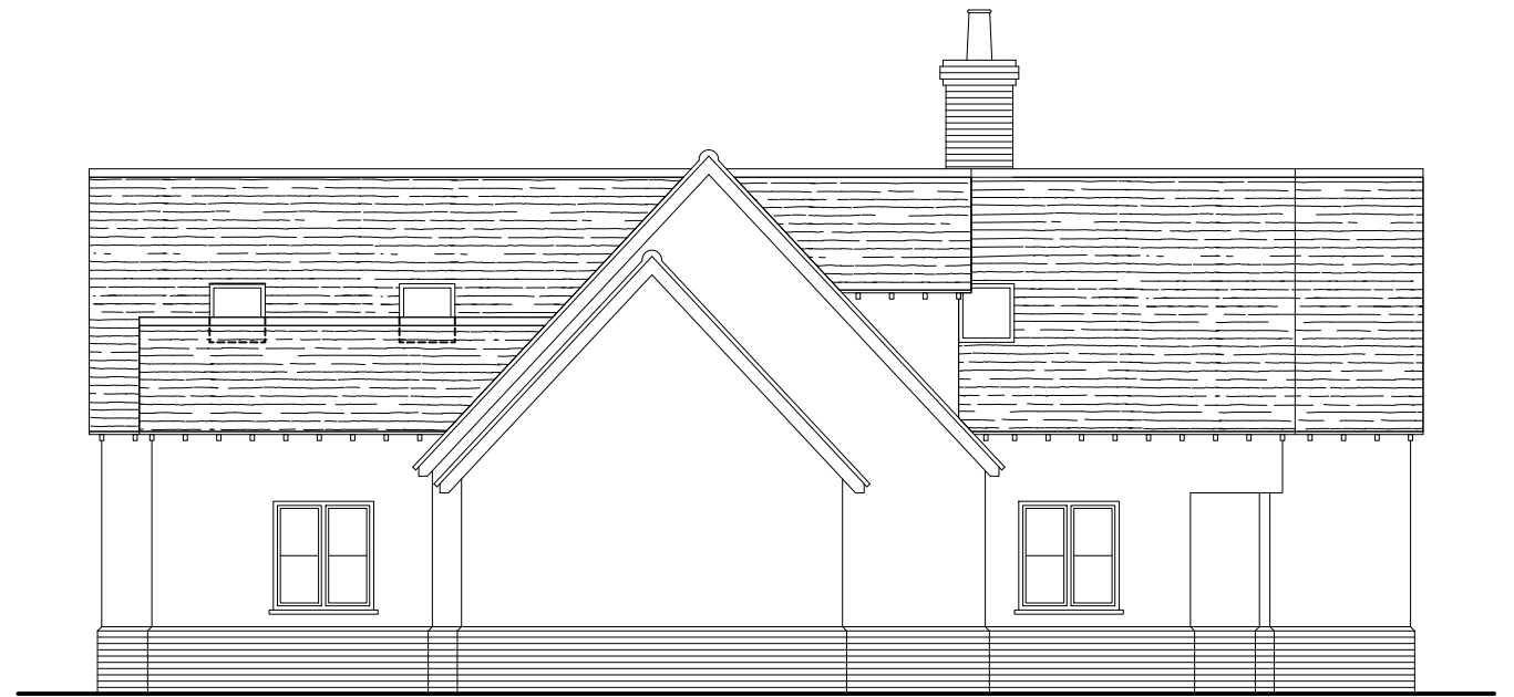
Side elevation (Southwest)