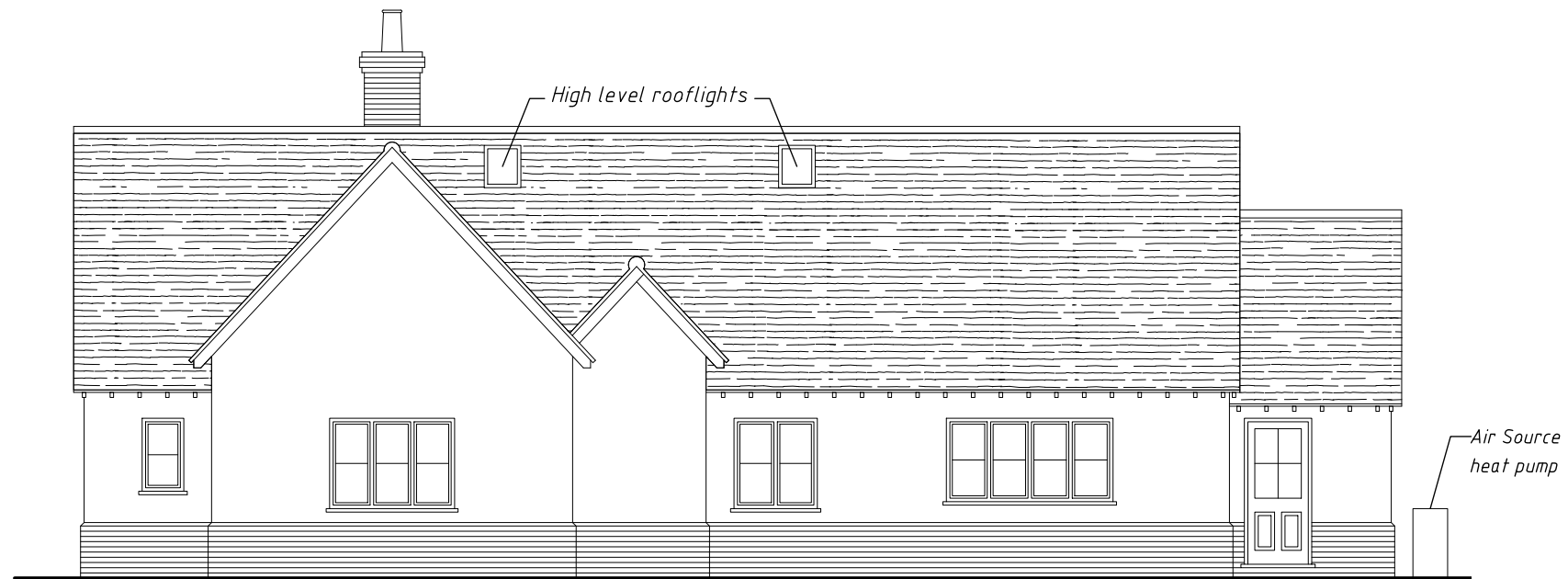
Rear elevation (Northwest)