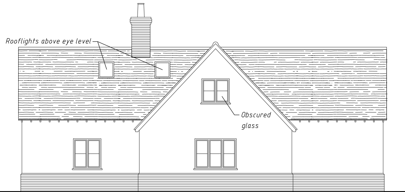
Side elevation (Northeast)