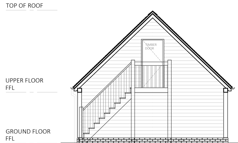
02 | PROPOSED NORTH ELEVATION 07-201 | SCALE 1:100 @A3