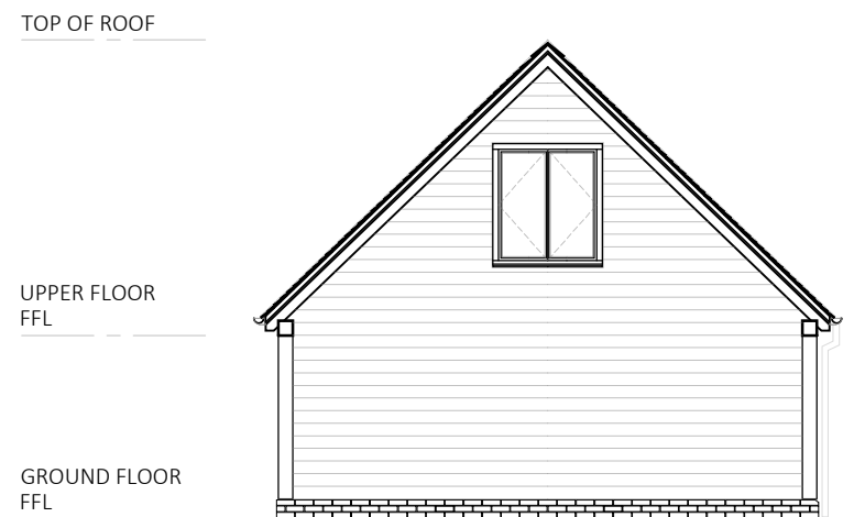
04 | PROPOSED SOUTH ELEVATION 07-201 | SCALE 1:100 @A3