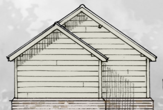
PROPOSED LEFT SIDE ELEVATION