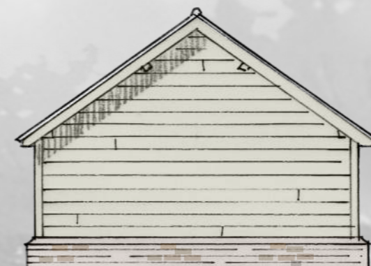
PROPOSED RIGHT SIDE ELEVATION