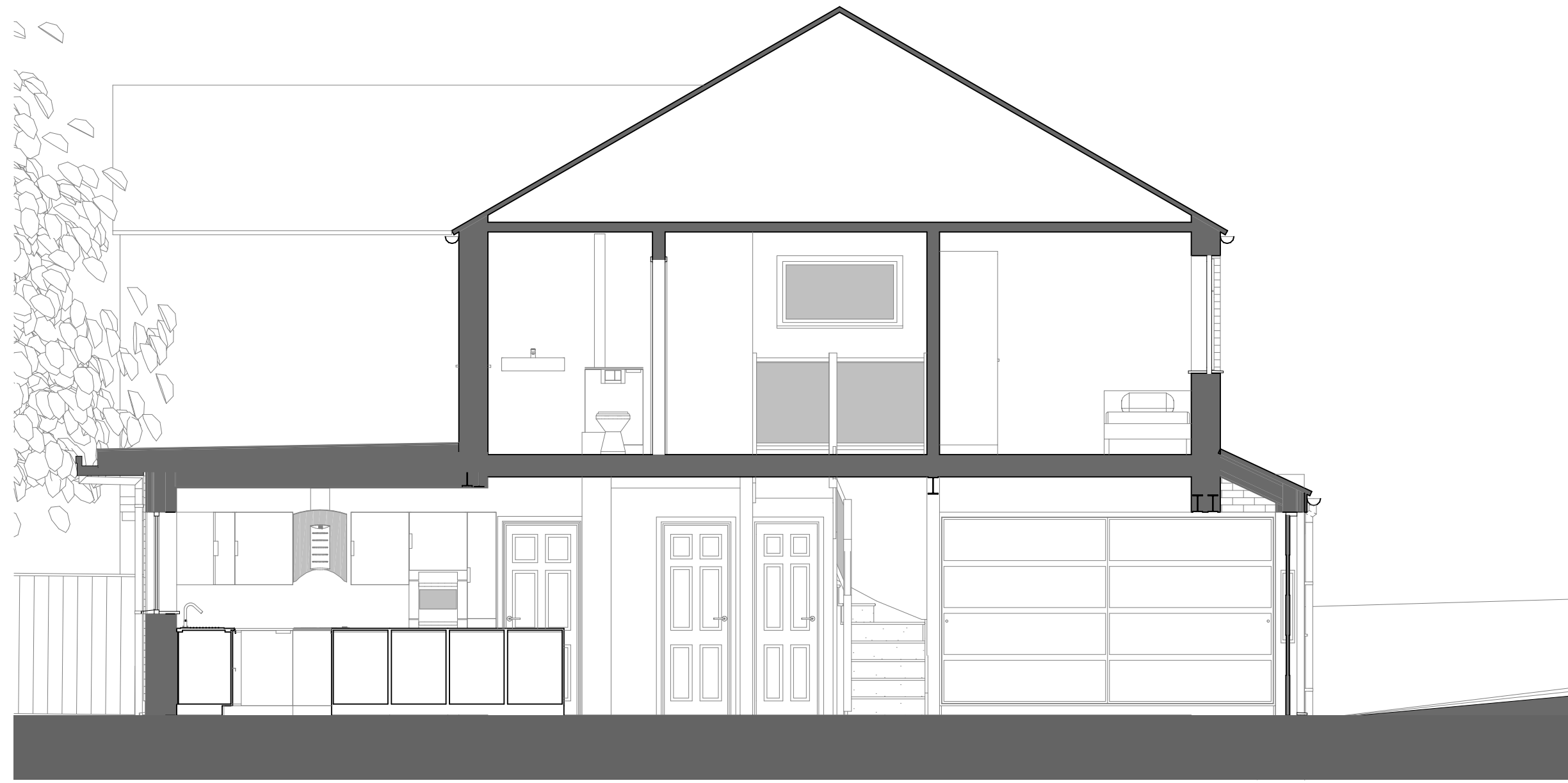
S-01 Building Section 1:50