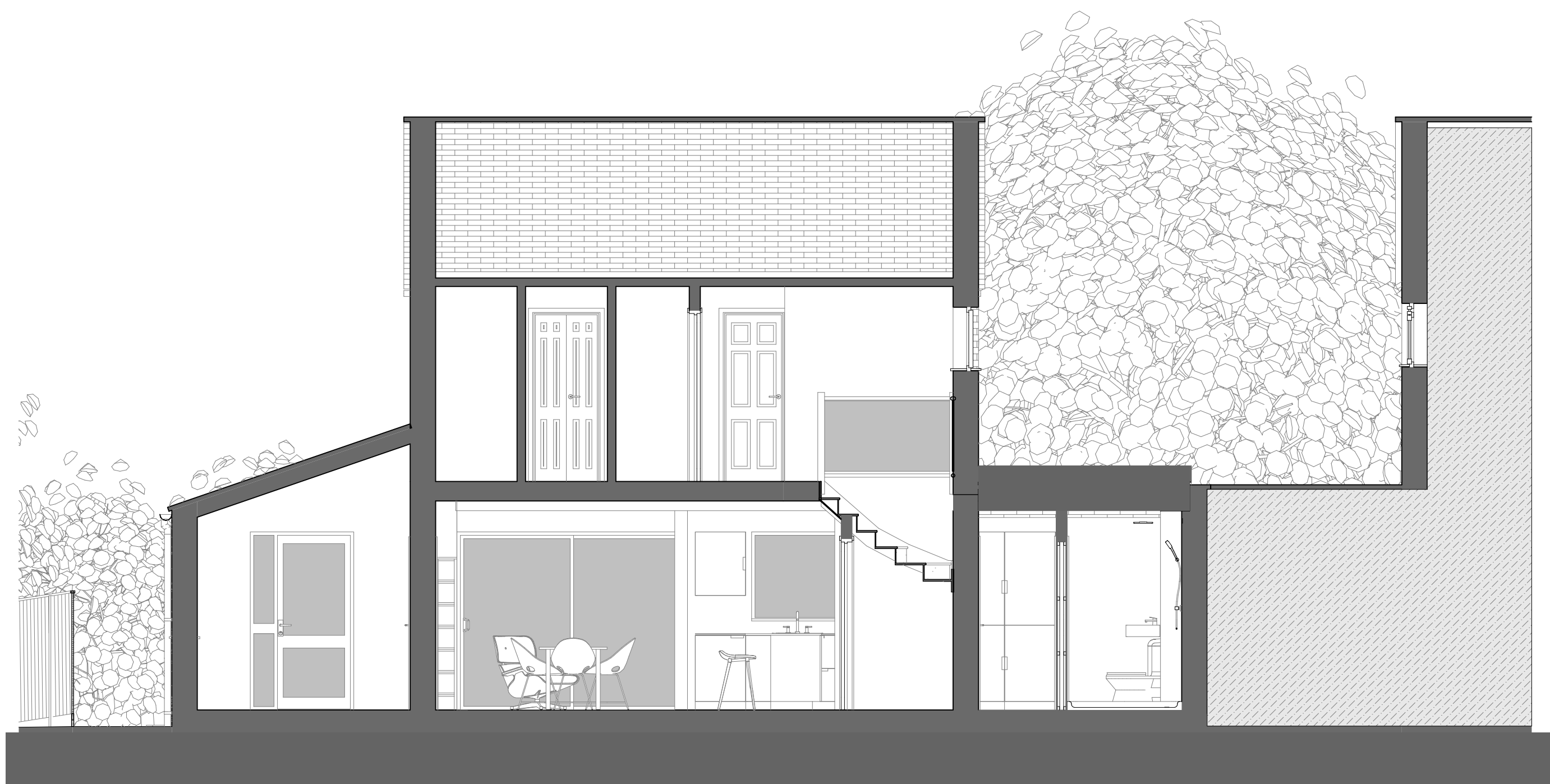
S-02 Building Section 1:50