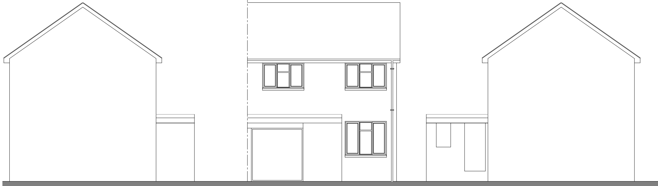
SIDE ELEVATION - AS EXISTING