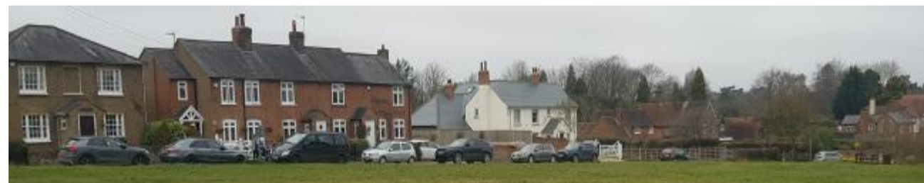
EXISTING STREET SCENE