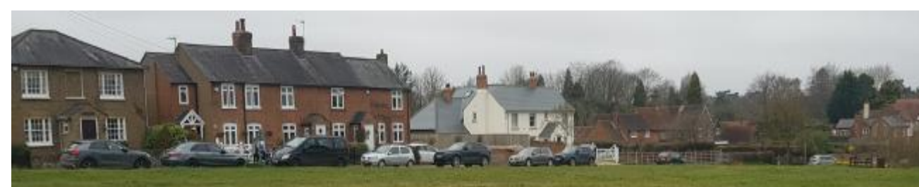
EXISTING STREET SCENE