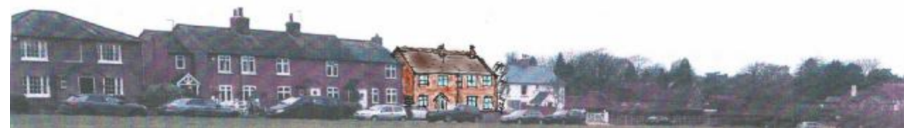
PROPOSED STREET SCENE