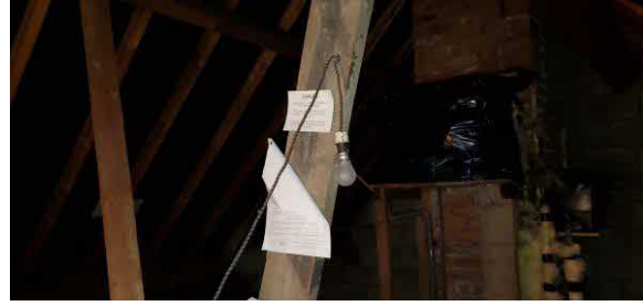
12 Internal view of loft