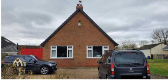
1 North aspect