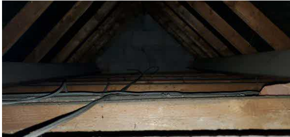
13 Internal view of loft – section over bedroom