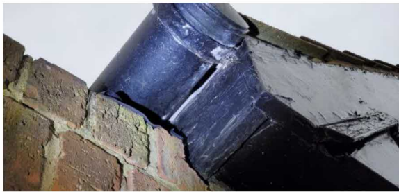
5 Gap between fascia and tiles