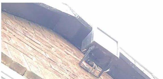
9 Gap between soffit and wall on south gable