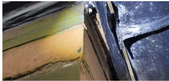
6 gap under fascia