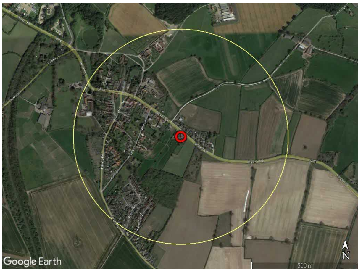
Figure 1 – Site Location

The habitats in the area are suitable for foraging and commuting bats.