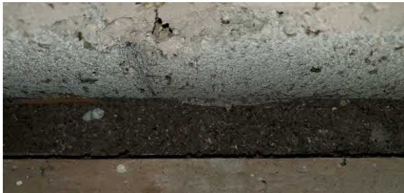
15 Bat droppings directly under gable wall