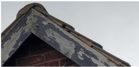
7 Gaps in mortar at the rake