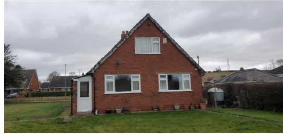
2 South aspect