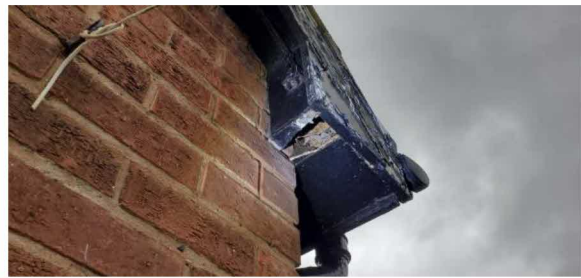
8 Hole in soffit with bird nesting material