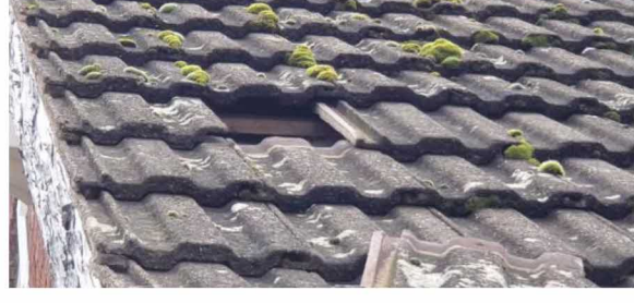
10 Missing tile