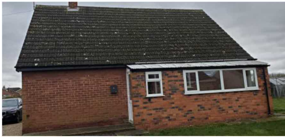
3 West aspect