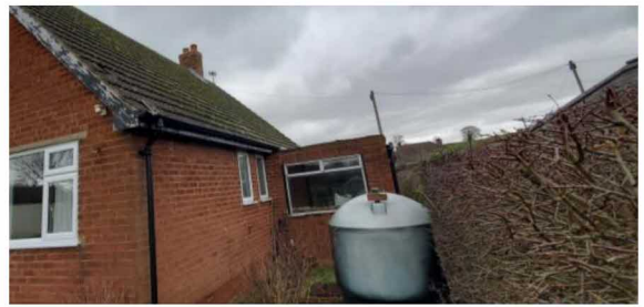
4 East aspect