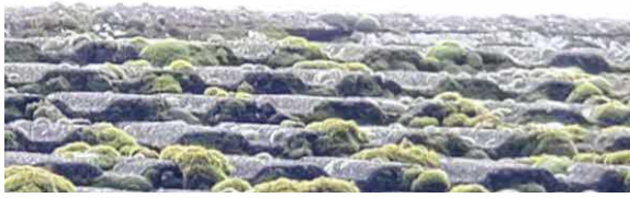
11 Possible gap to ridge beam under ridge tile