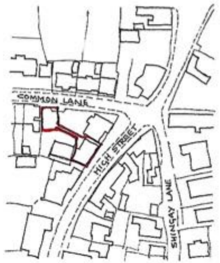
LOCATION PLAN. 1:1250

STEPHEN R. FRIDAY FGBC Building Design Service