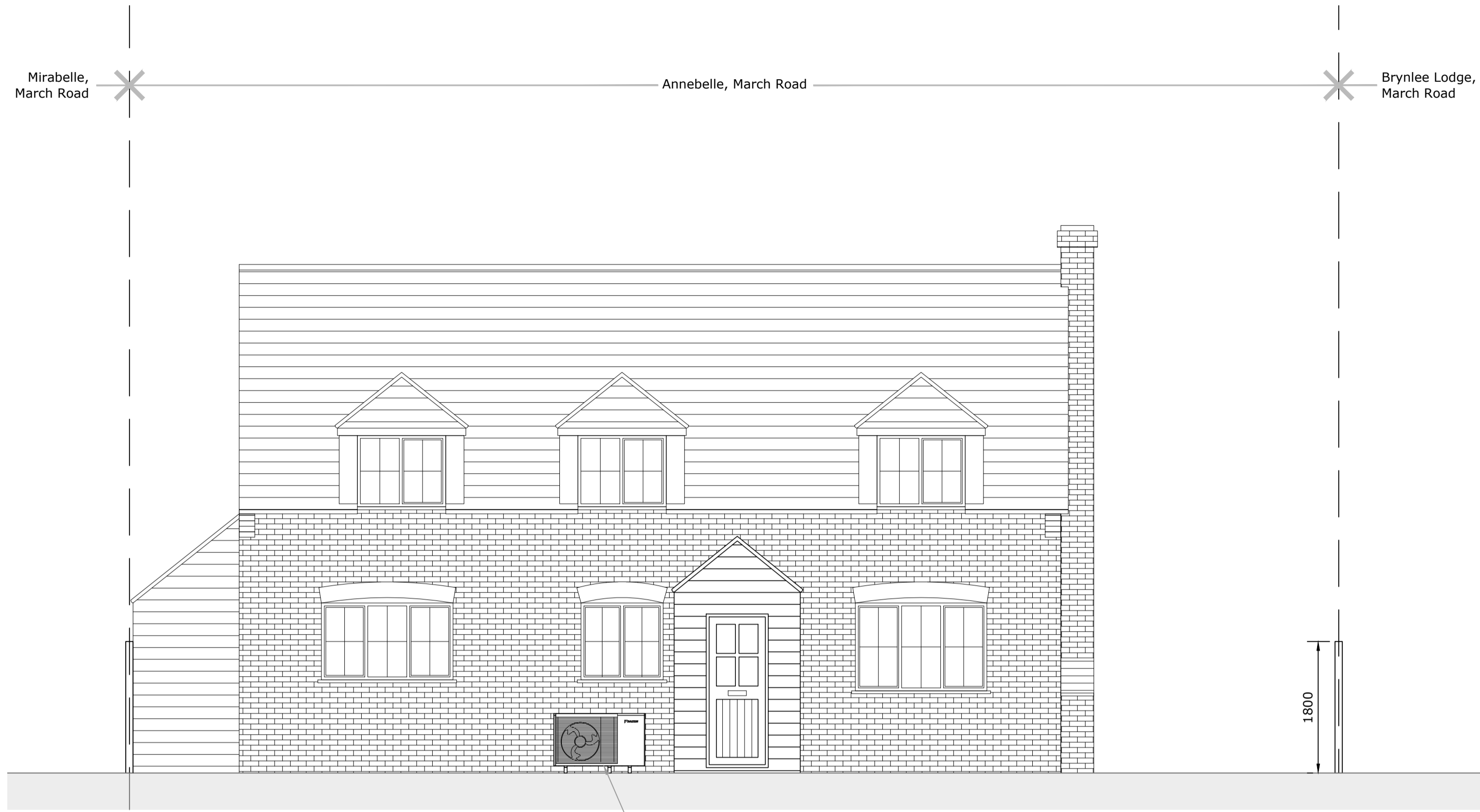
front elevation (north west facing) as proposed 1:50 proposed air source heat pump