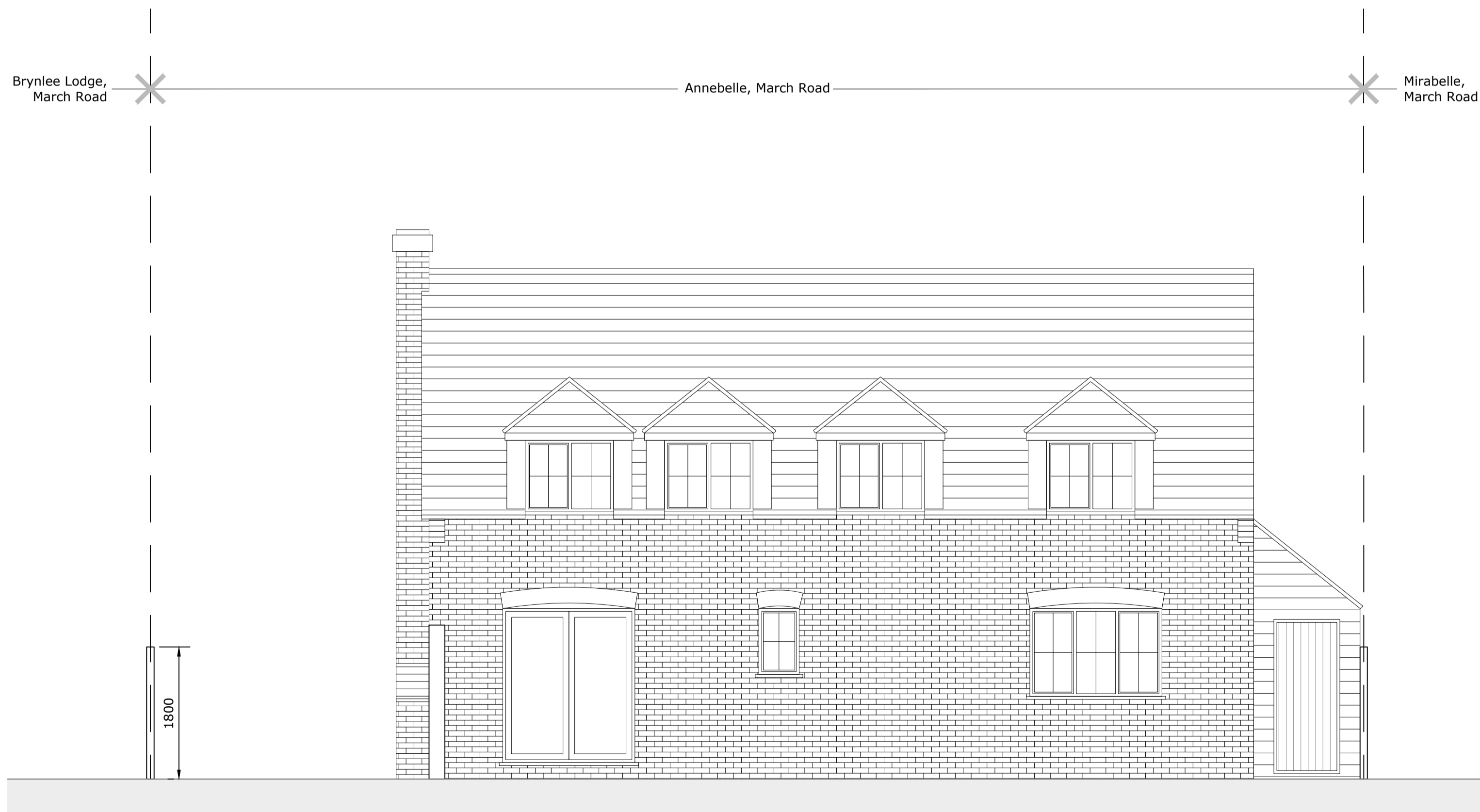
rear elevation (south east) as proposed 1:50