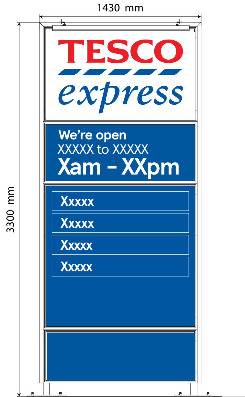
SIGN 10 1430x3300 mm New 3.3m high internally illuminated double sided gantry