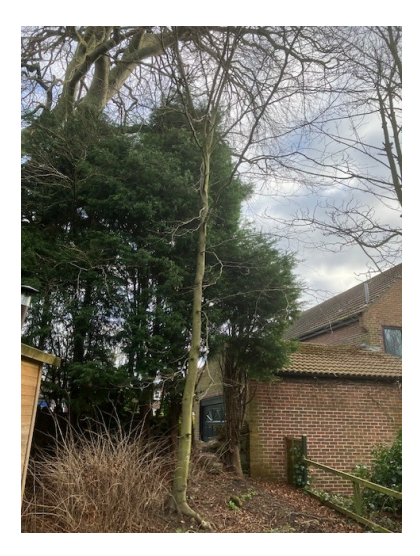
One of the two self seeded saplings to be removed