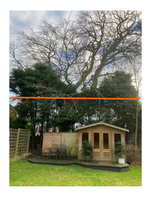
Conifers to the rear of summer house be reduced by 2.5 \, \mathrm{m}