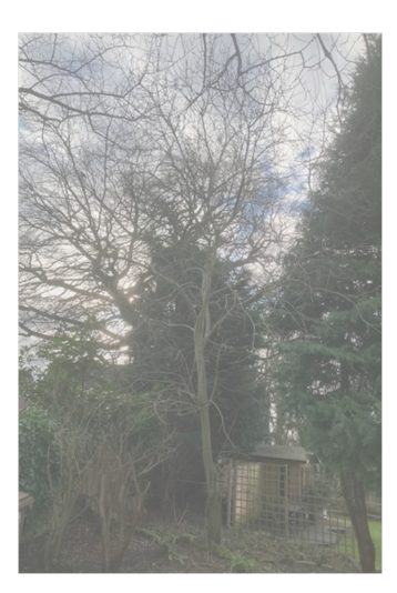
One of the two self seeded saplings to be removed