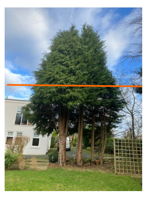
Conifers at the end of the drive to be reduced by 3m