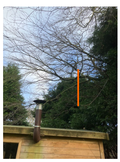
The lower branch's overhanging the summer house to be cut back to the fence line.