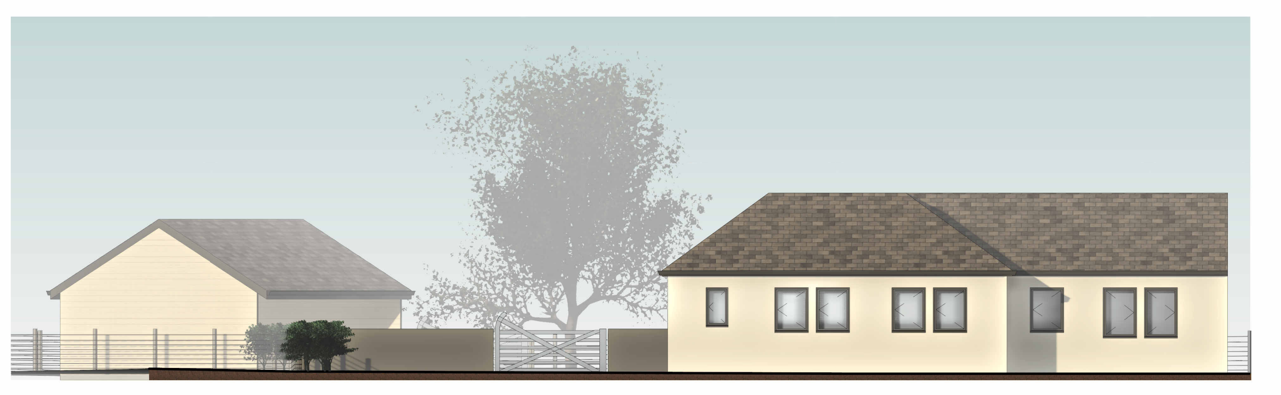
East 1 : 100