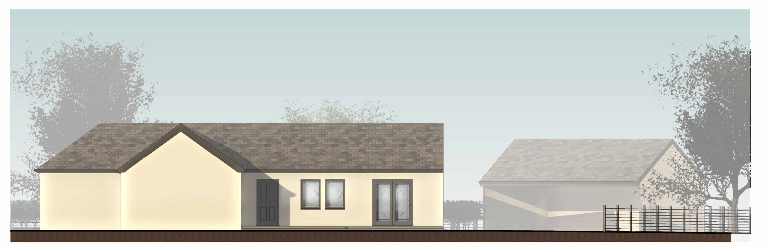
South 1: 100