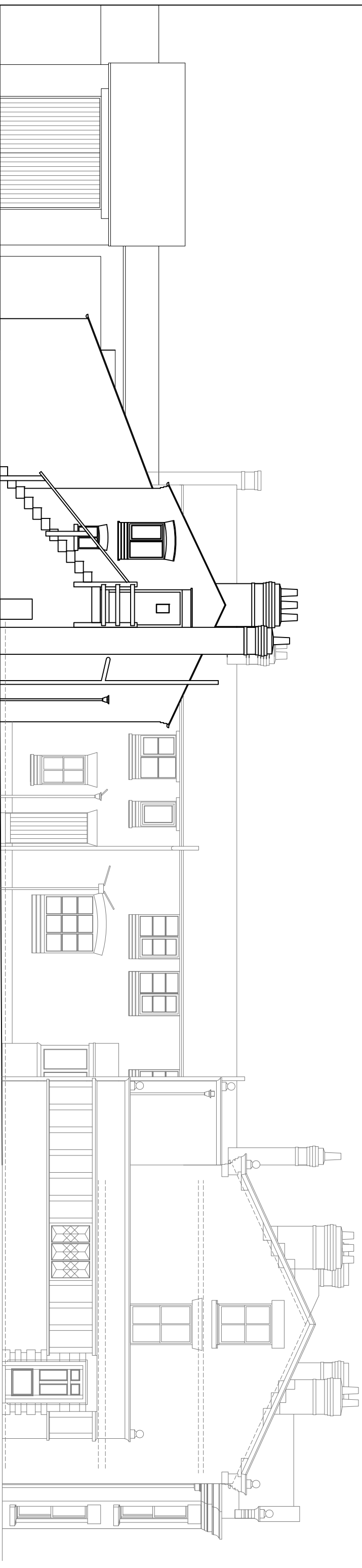
South West Facing Elevation