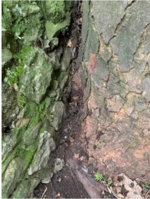
Tree lifting and pushing wall out of line