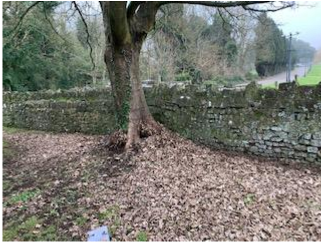
Tree on left hand side of Graveyard.