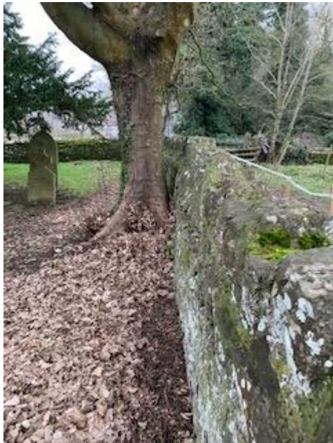
Wall with noticeable lean.