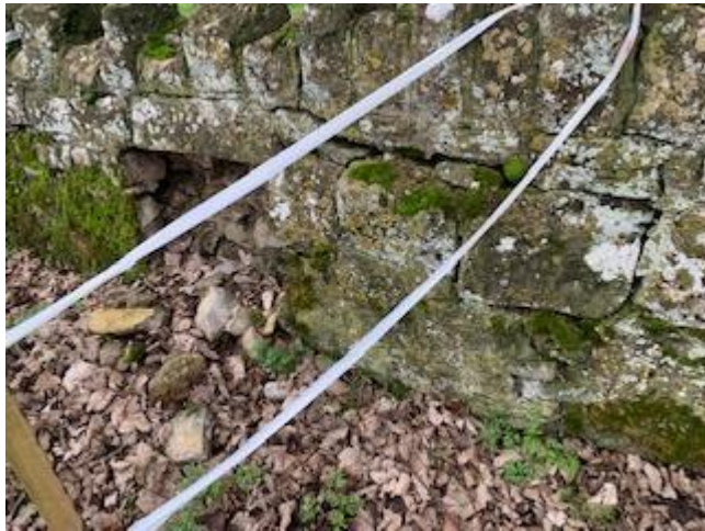
Wall cracked and damaged.