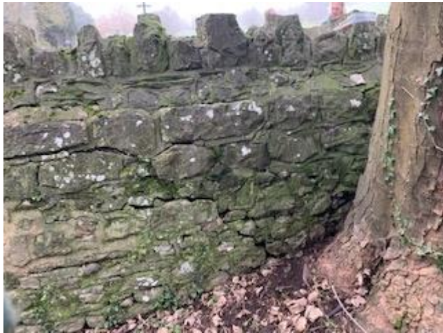
Cracking to wall structure