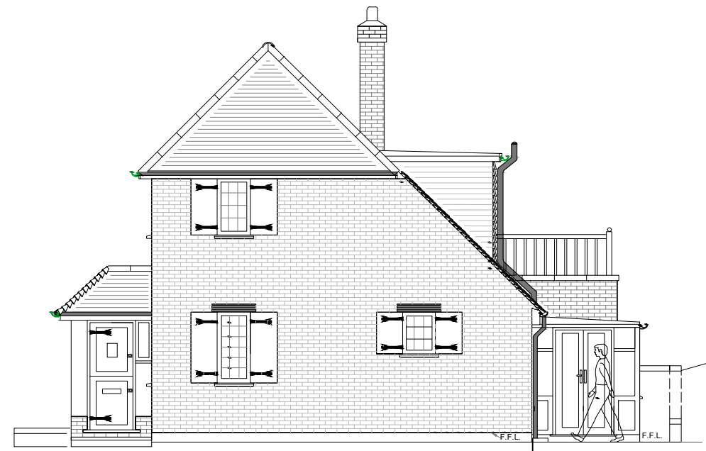
02 EXISTING SIDE ELEVATION