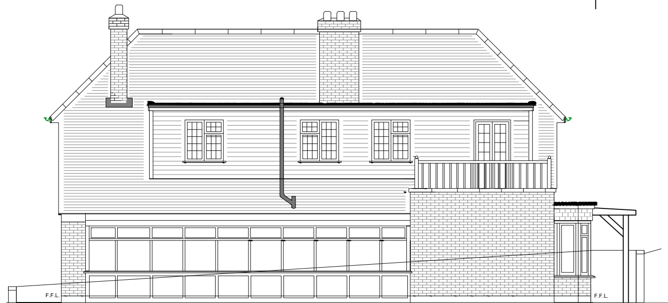
04 EXISTING REAR ELEVATION