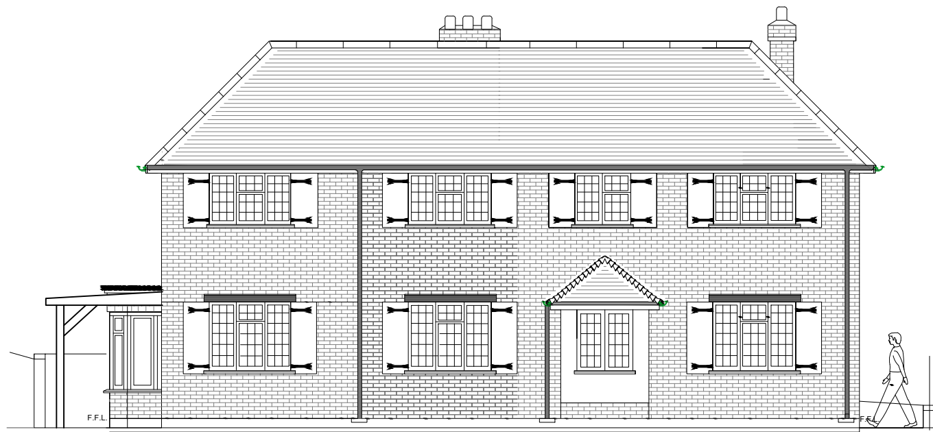
01 EXISTING FRONT ELEVATION