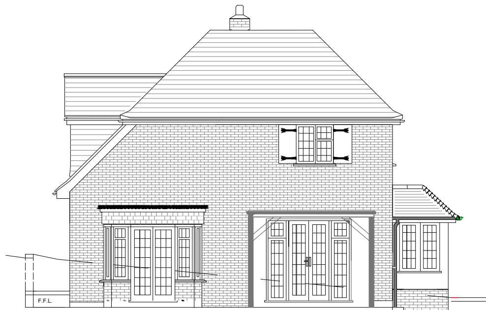
03 PROPOSED SIDE ELEVATION