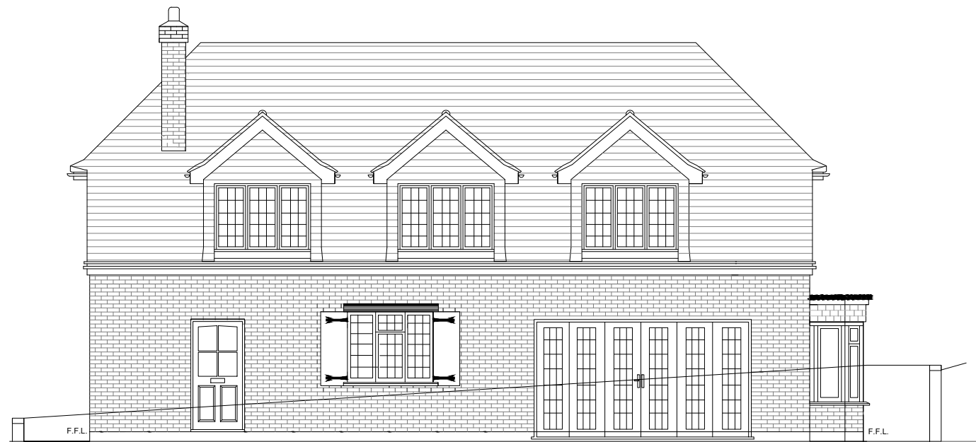
04 PROPOSED REAR ELEVATION