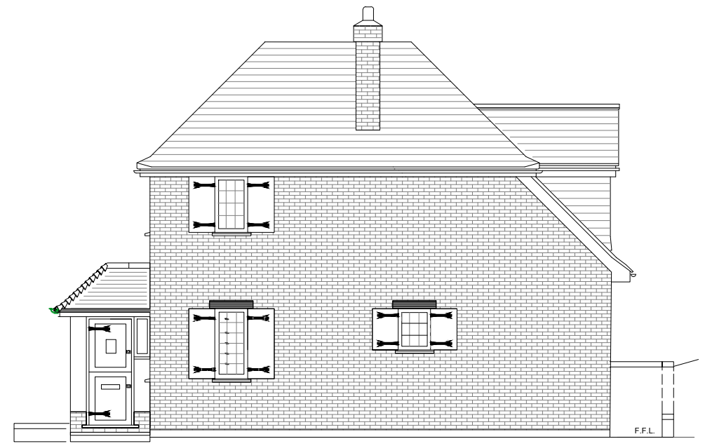
02 PROPOSED SIDE ELEVATION