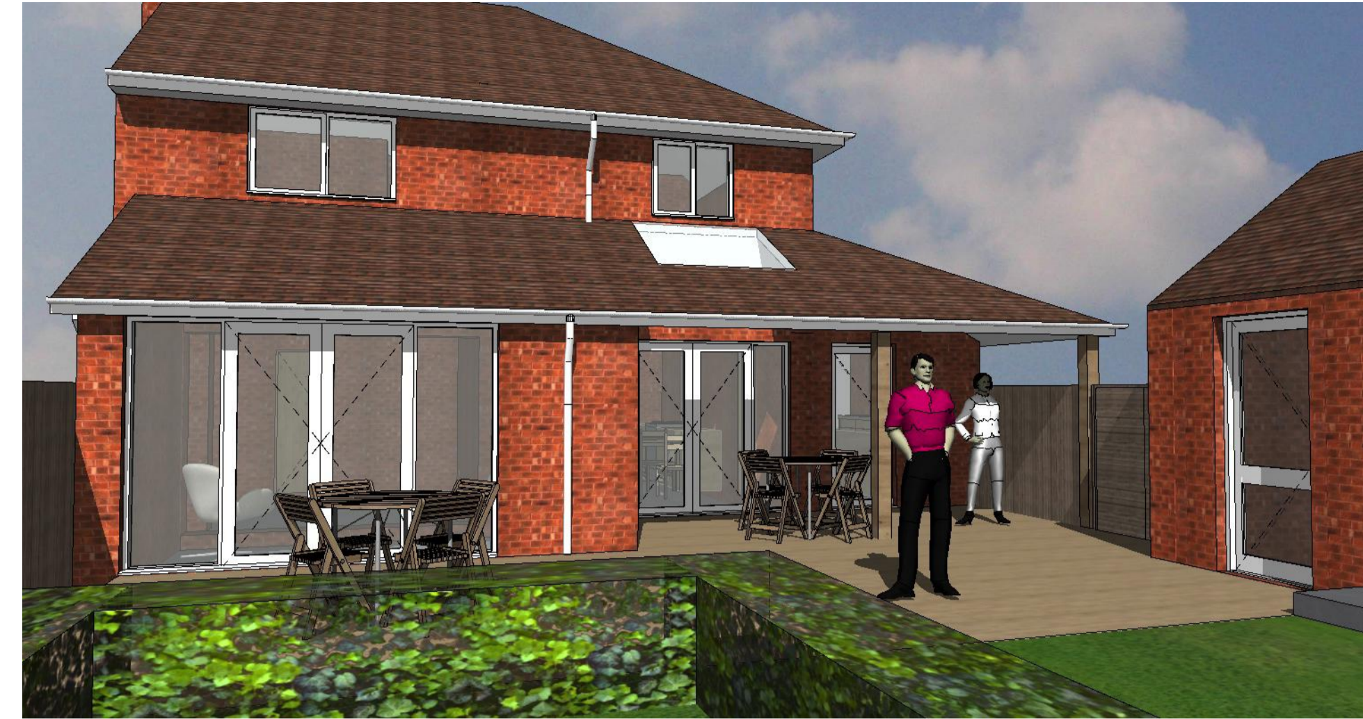
6 Generic Perspective (12) 1:208.33