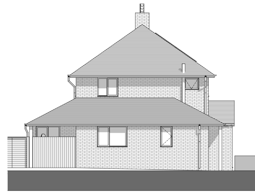
E-03 Elevation (3) 1:100