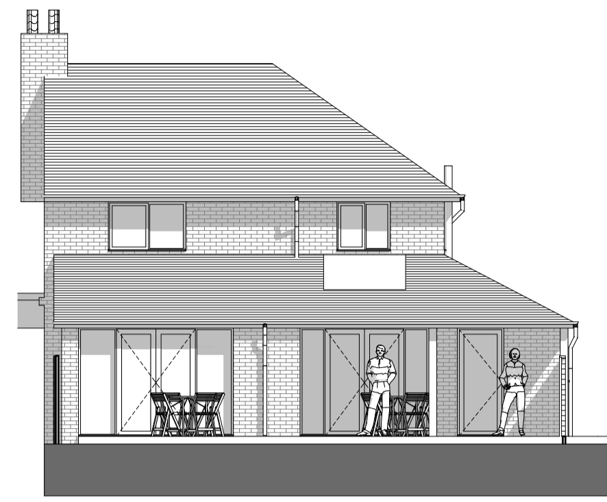
E-02 Elevation (4) 1:100