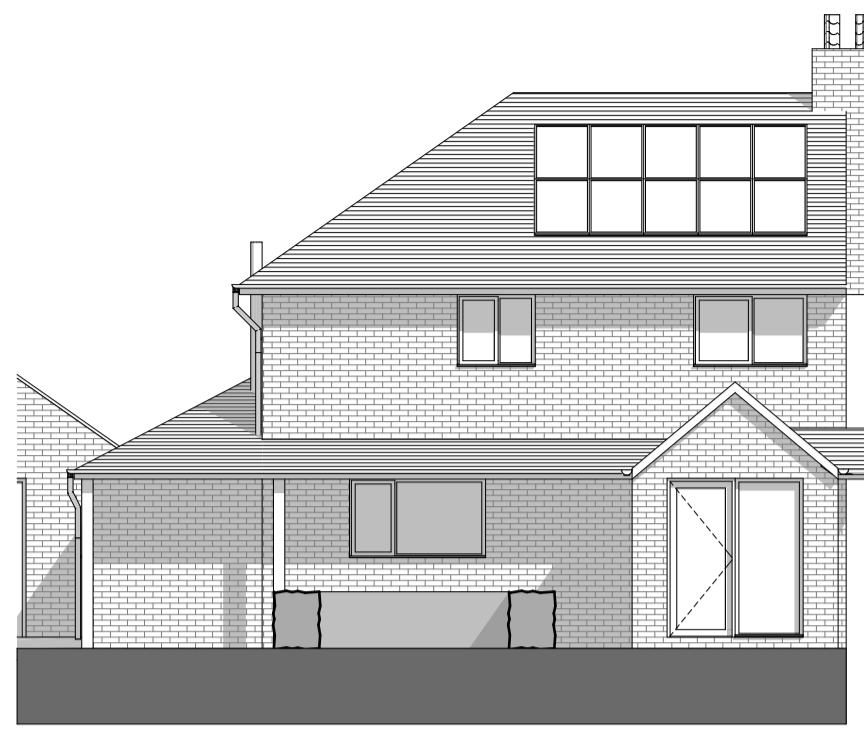
E-01 Elevation (5) 1:100