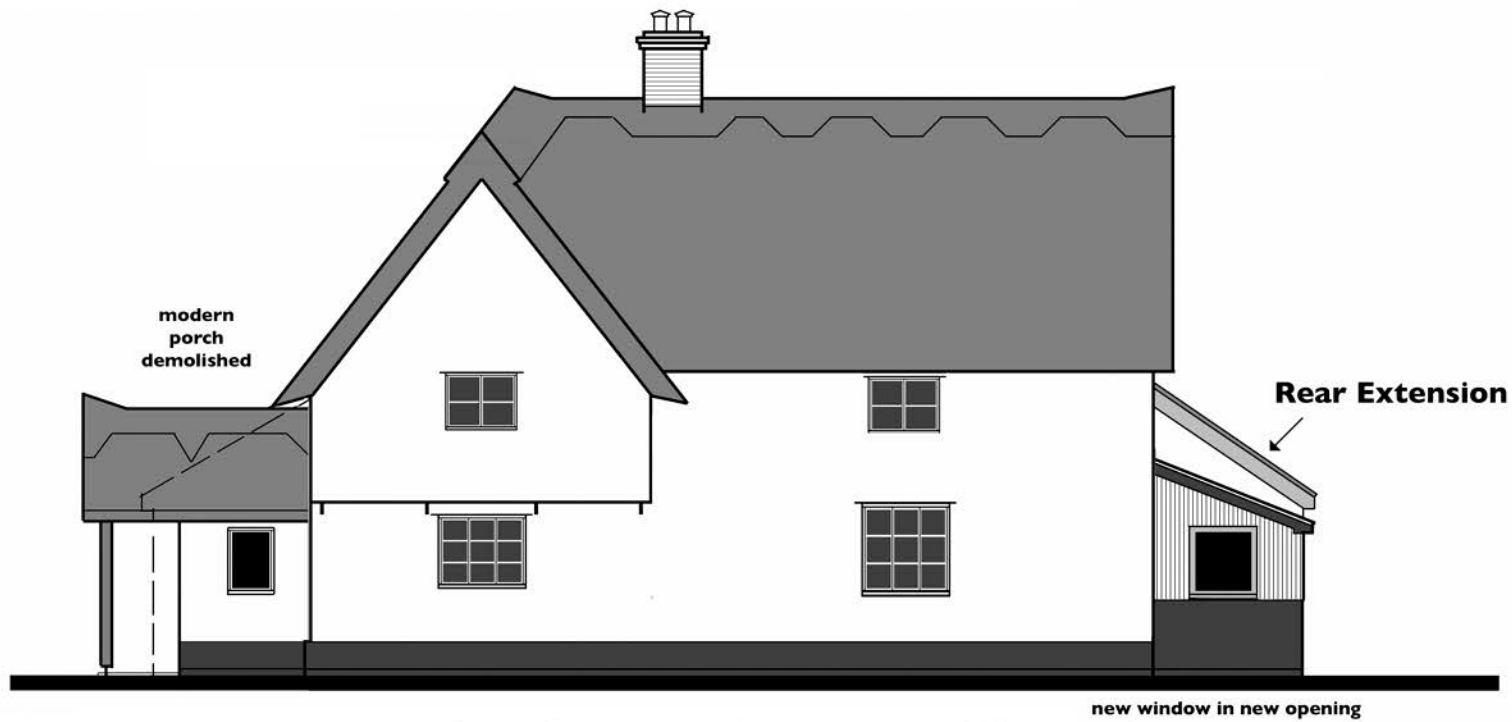
:: Front (East) Elevation :: 1:100 at A3 ::