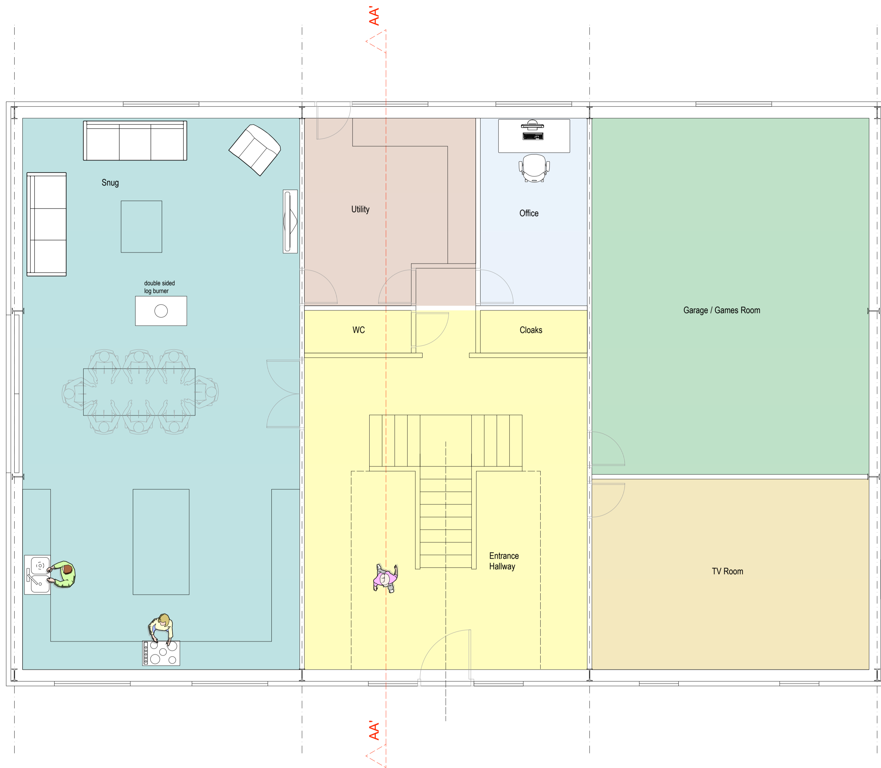
PROPOSED GROUND FLOOR PLAN 1:50