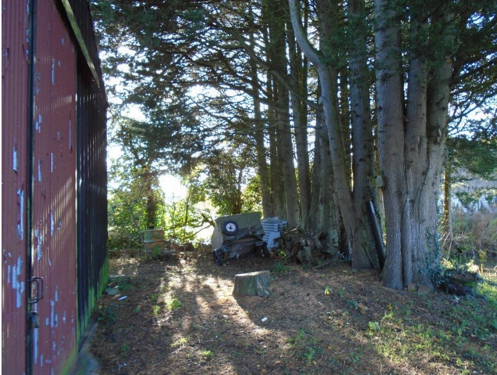
Photograph by Roger Spring 2023