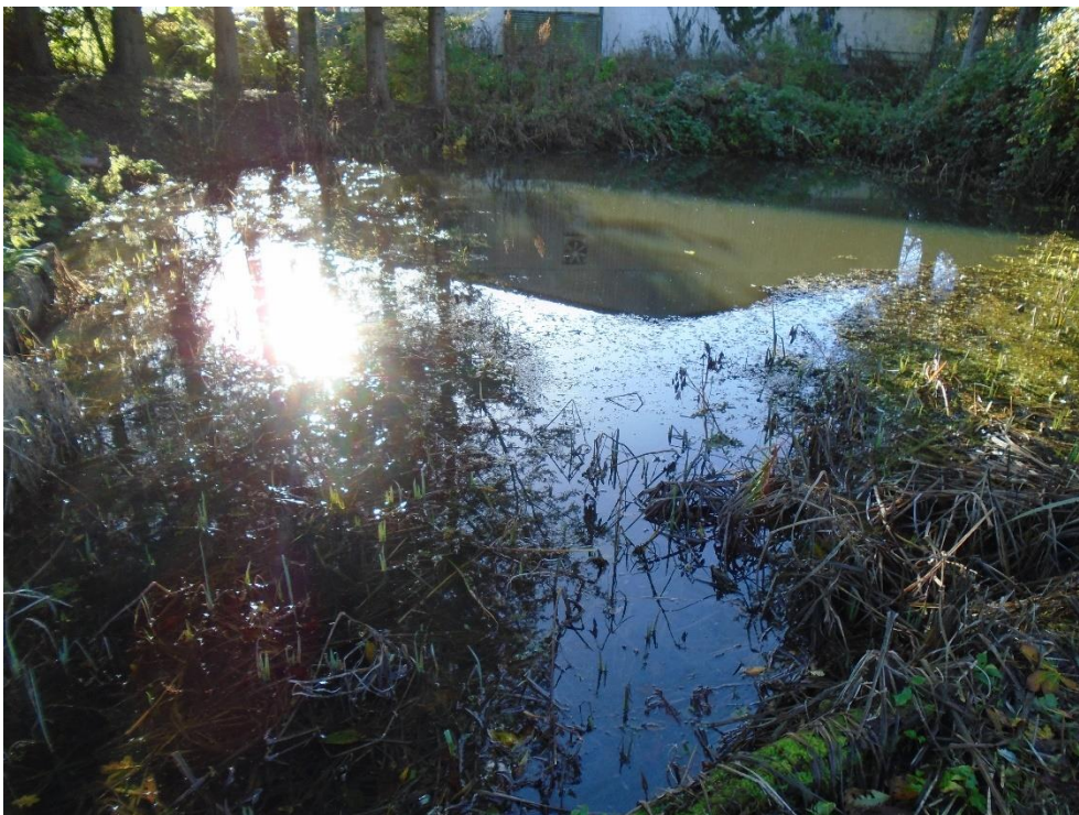
Photograph by Roger Spring 2023