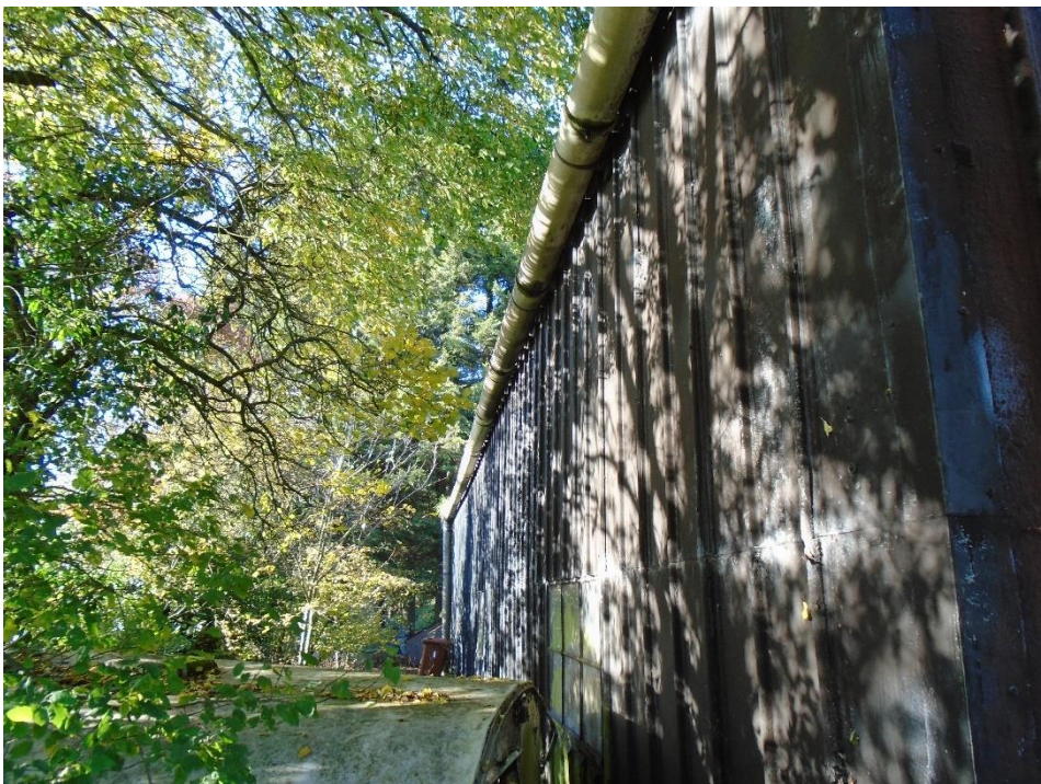
Photograph by Roger Spring 2023