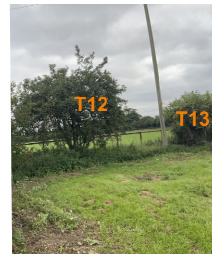
SITE PHOTO 'B'

PROJECT: LAND AT CHANDOS FARM, BULL ROAD, THORNHAM PARVA, SUFFOLK