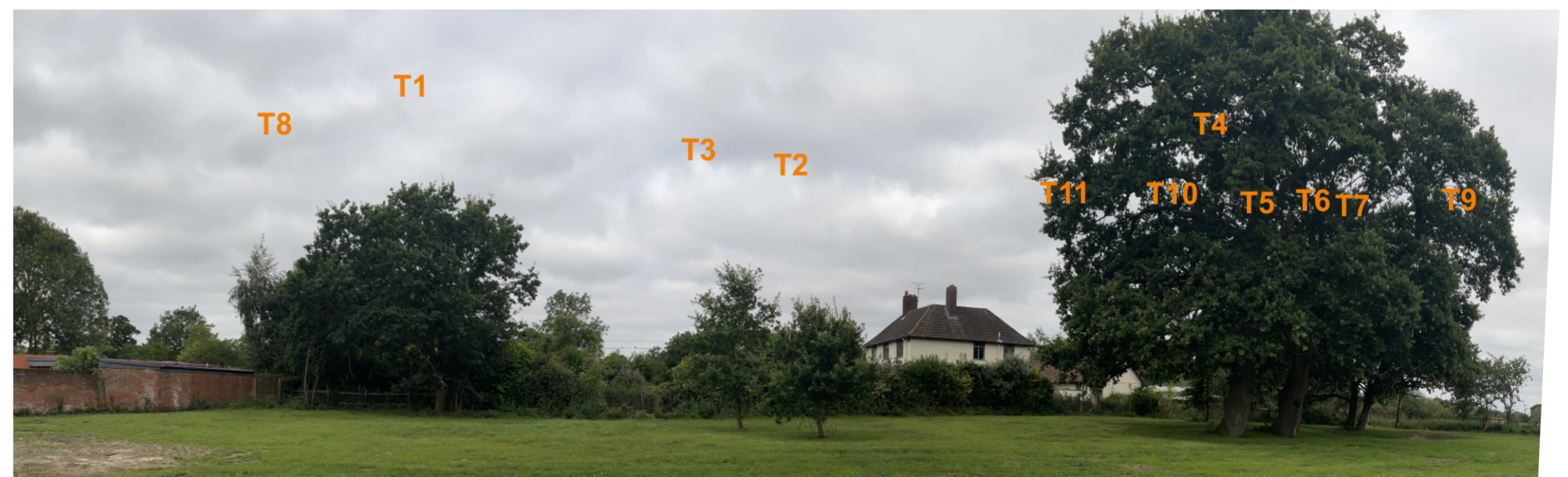
SITE PHOTO 'A'