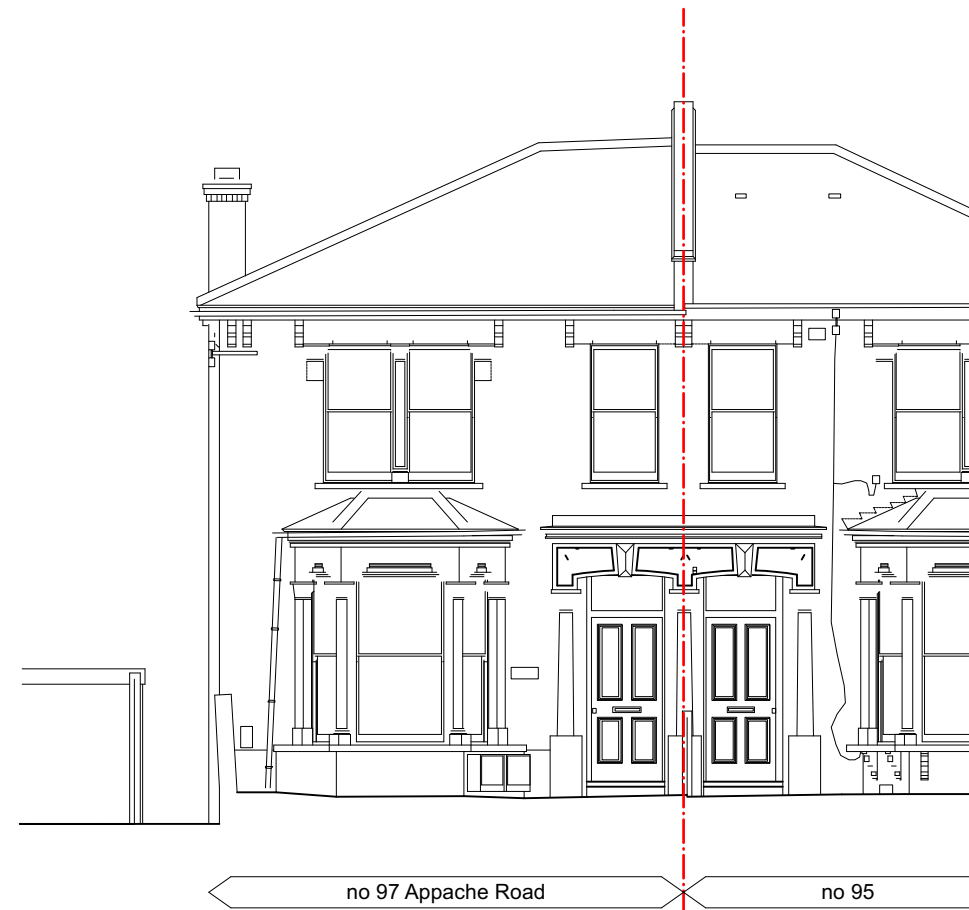
EXISTING SOUTH WEST ELEVATION Scale 1:100