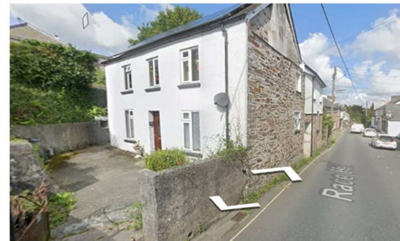
Views from Race Hill