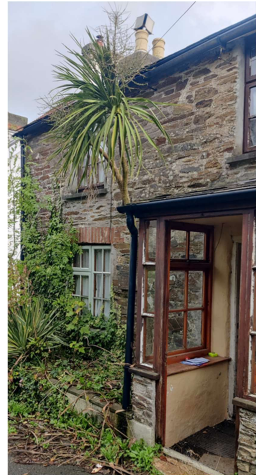
Image of Front Elevation