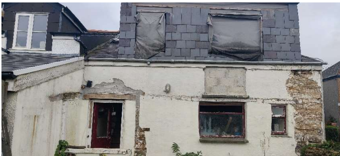
Image of Rear Elevation