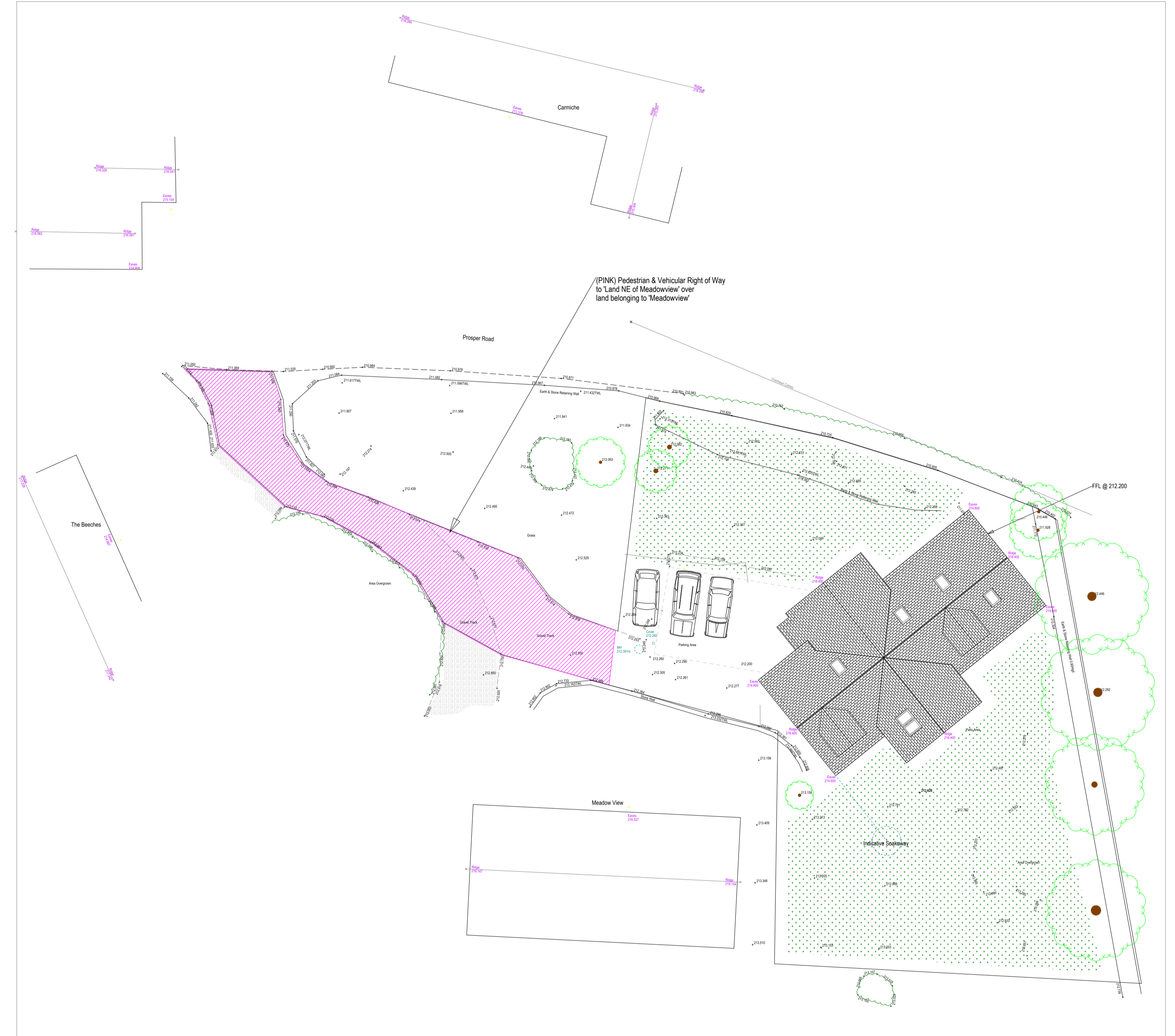
Proposed Block Plan @1:200