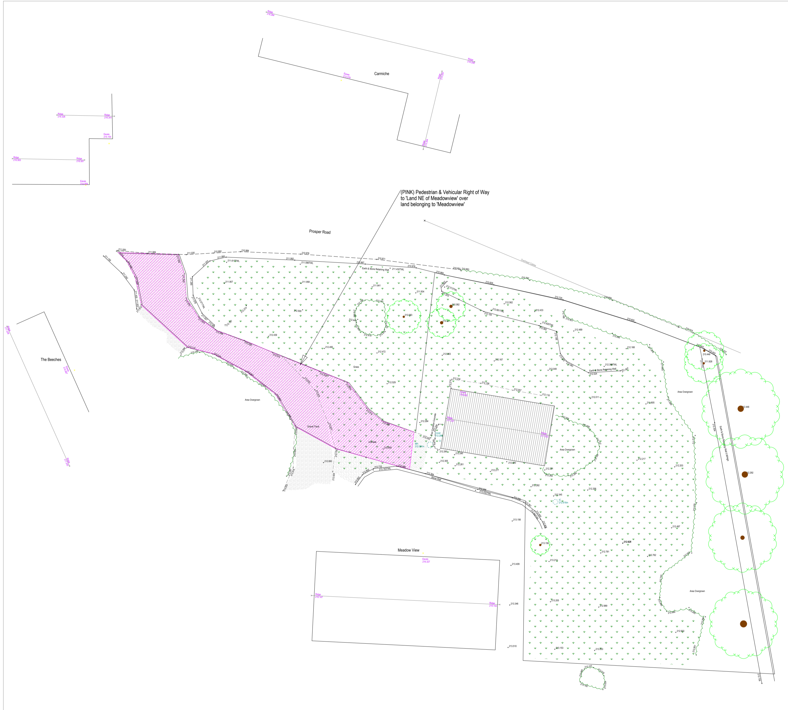
Existing Block Plan @1:200