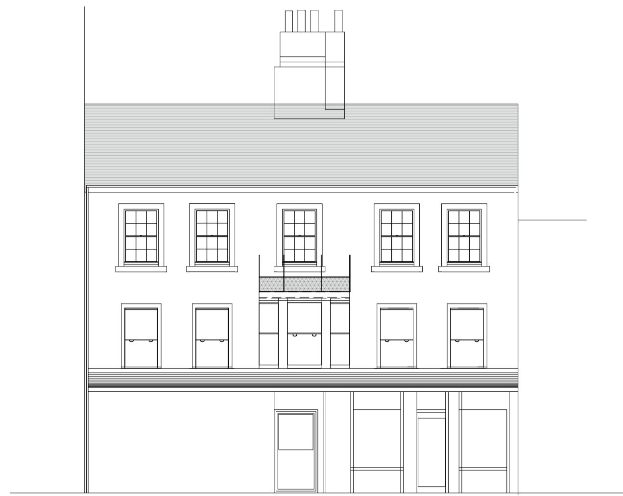
West Elevation - Existing/Proposed