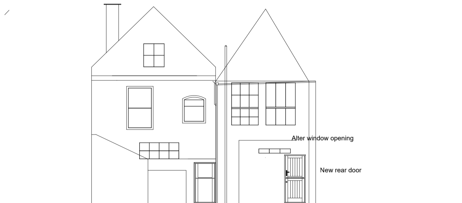
East Elevation - Proposed