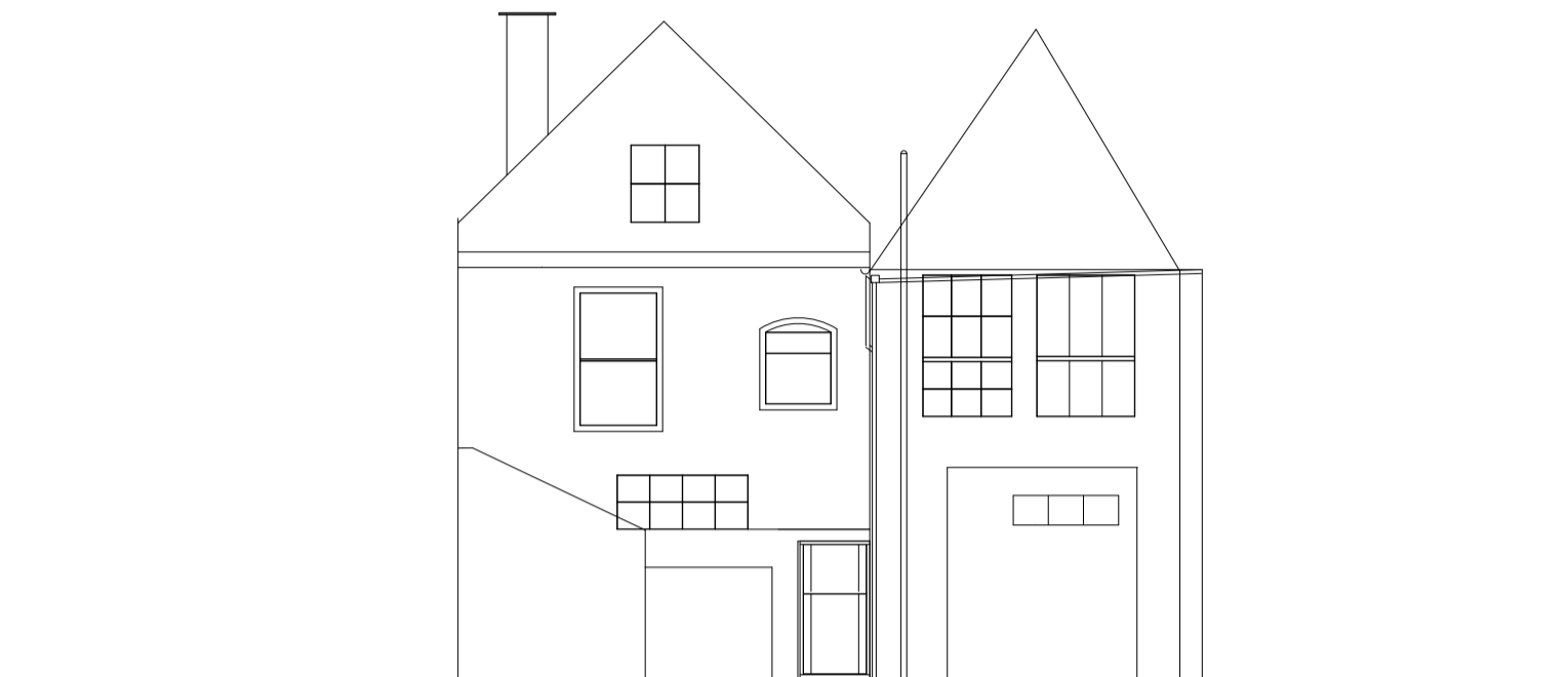
East Elevation - Existing