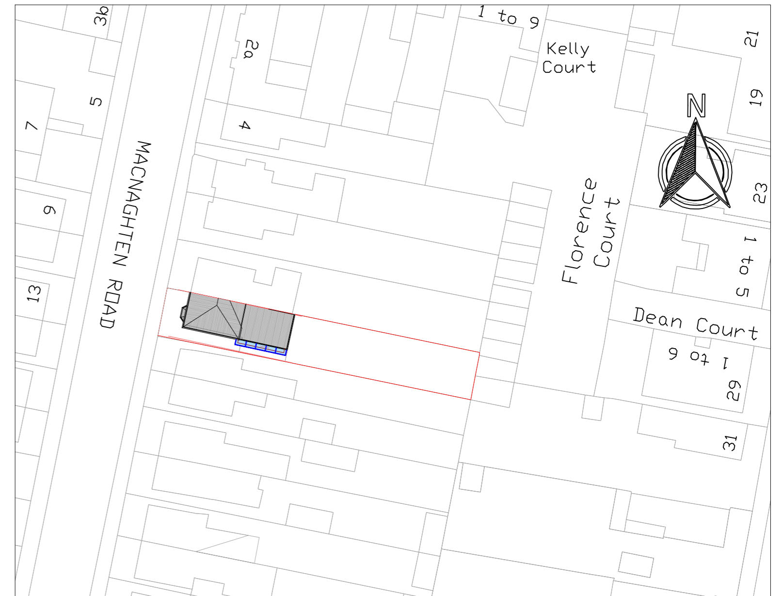
PROPOSED BLOCK PLAN 1:500