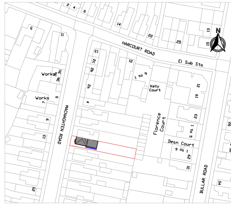
PROPOSED SITE PLAN 1:1250