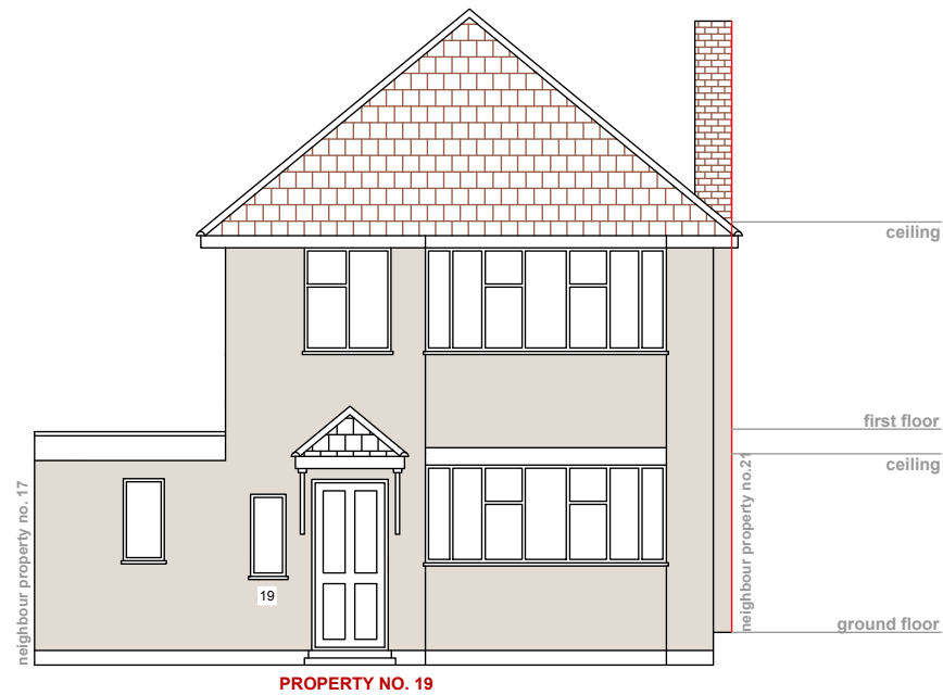
07 FRONT ELEVATION - EXISTING 1:100 @A3

3 X MK04 VELUX SKYLIGHT ON FLAT ROOF MEASURING 780MM X 980MM