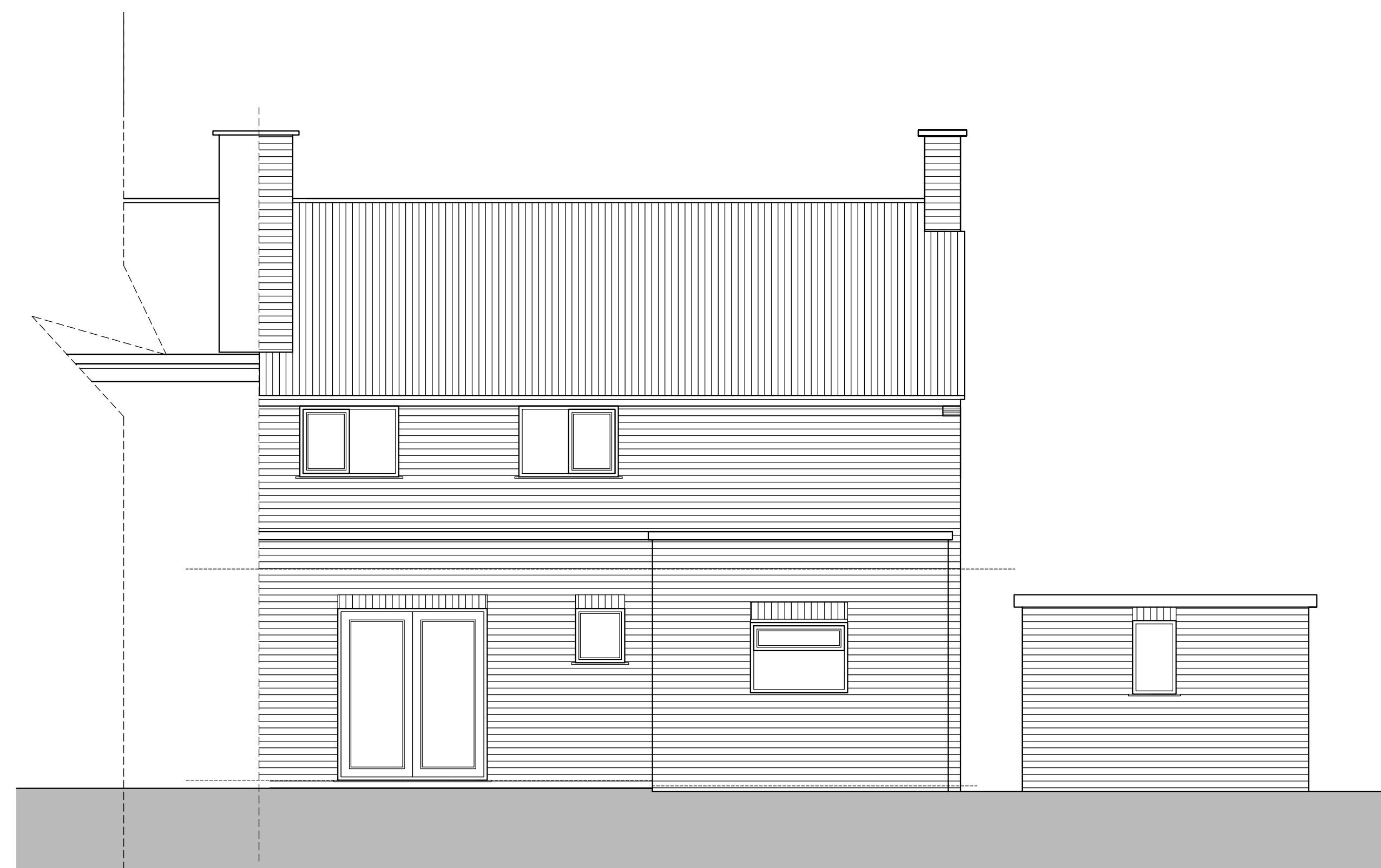
REAR ELEVATION AS EXISTING 1:50