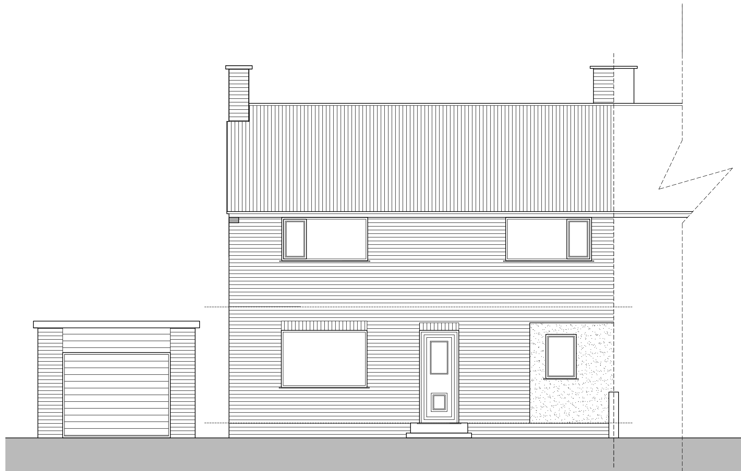
FRONT ELEVATION AS EXISTING 1:50

Worcester architects are appointed as 'Designer only, unless a written appointment has been completed for the formal appointment as 'Principal Designer'