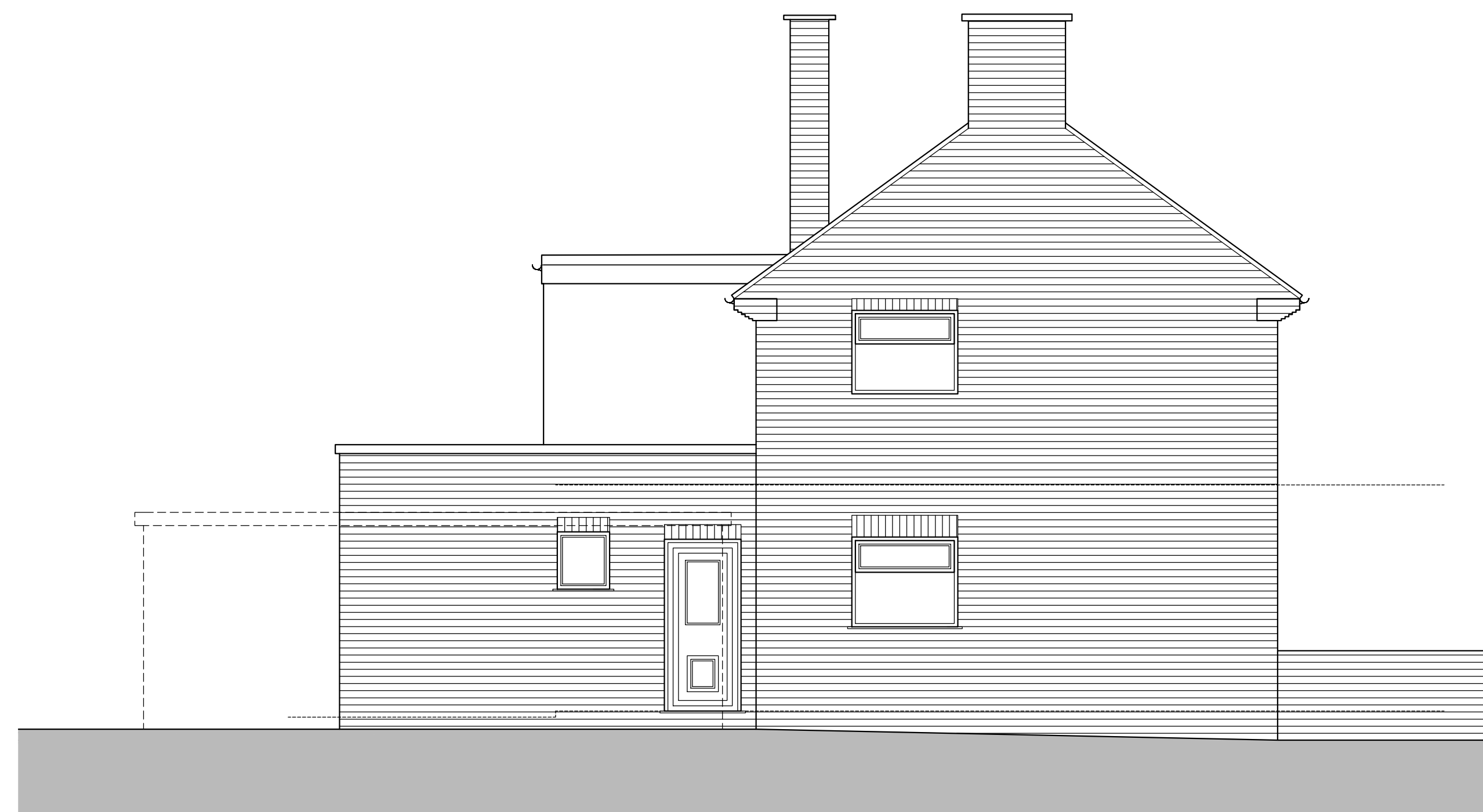
SIDE ELEVATION AS EXISTING 1:50