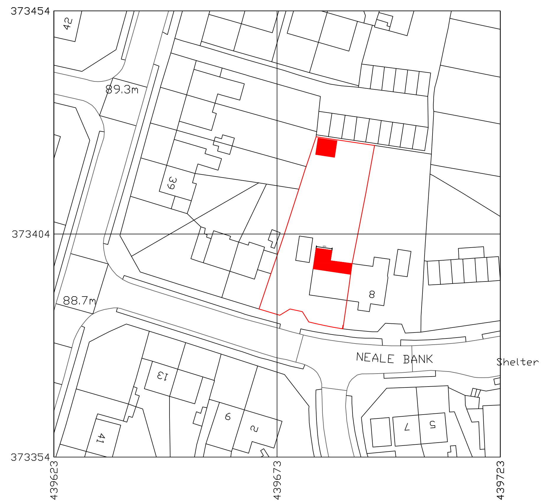
BLOCK PLAN AS PROPOSED 1;500

Worcester architects are appointed as 'Designer' only, unless a written appointment has been completed for the formal appointment as 'Principal Designer'